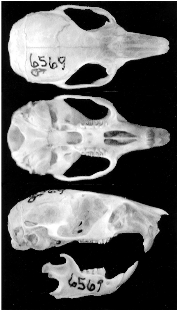
FIG. 2. Dorsal, ventral, and lateral views of skull and lateral views of mandible of an adult male Zapus princeps (Brigham Young University, Monte L. Bean Museum #6569) from Eccles Canyon, Carbon Co., Utah. Occipitonasal length is 24.6 mm.

nal dimensions generally decrease from north to south. The smallest individuals are found in the southernmost range extremes, whereas the largest are found in the Great Basin near the geographic center of the distribution of the species (Kruttsch 1954).