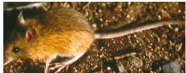
FIG. 1. Photograph of adult Zapus princeps .

GENERAL CHARACTERS. Zapus princeps is mouse-like in appearance and of medium size. Total length is 216–247 mm and tail (129–148 mm) is longer than length of head and body ( n not available). Measurements of Z. princeps adults throughout their range are as follows: length of tail, 118–160 mm; length of hind foot, 25–35 mm; mass, 17–40 g; condyloincisive length, 19.4–22.8 mm; greatest braincase breadth, 9.4–11.3 mm; and zygomatic breadth, 10.9–13.7 mm (Jones 1981). Although not uniform, exter-