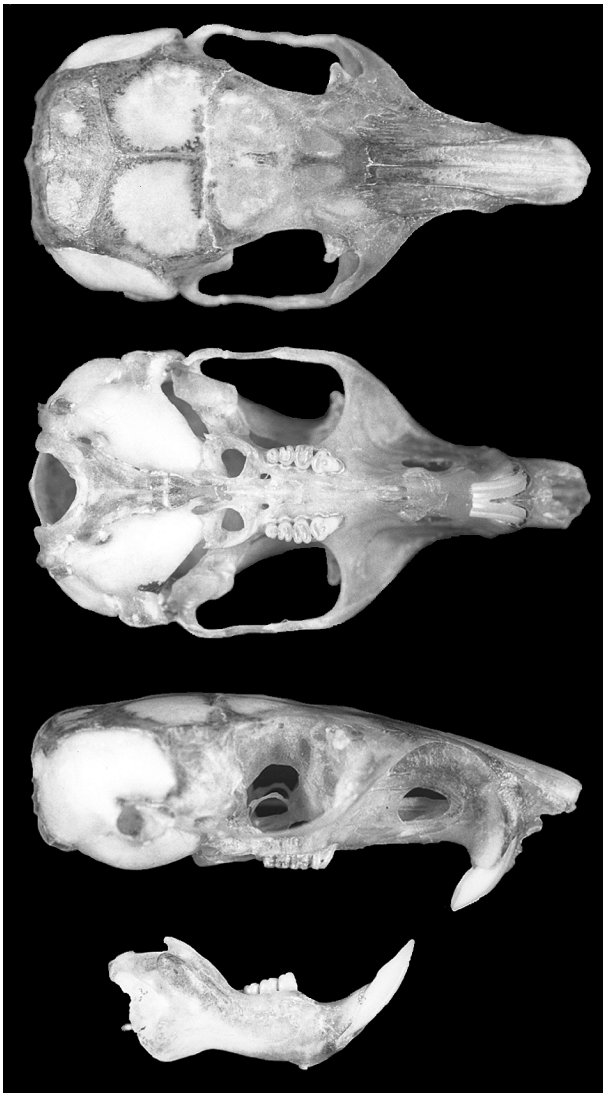
FIG. 2. Dorsal, ventral, and lateral views of cranium and lateral view of mandible of an adult male Chaetodipus penicillatus from Virgin River, 6.4 km S Littlefield, Mojave County, Arizona (T. L. Best 4084). Greatest length of skull is 28.2 mm.

shaft of tail that was attributed to damage to underlying caudal vertebrae (Howell 1923).