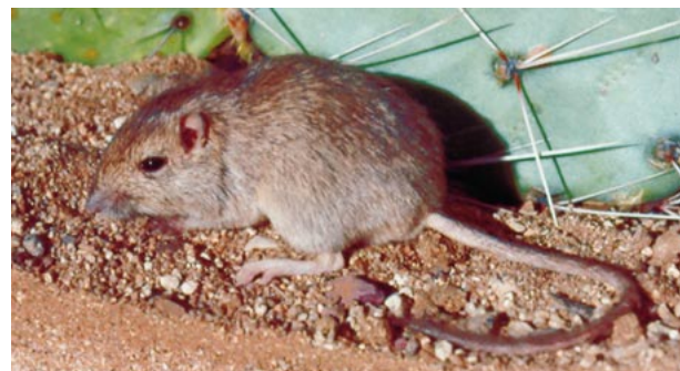
FIG. 1. Adult Chaetodipus penicillatus pricei from Santa Rita Experimental Range, Pima County, Arizona.

FORM AND FUNCTION. Pelage of individuals in volcanic Pinacate Mountains, where a layer of black dust covers sandy soils, is much darker than pelage of individuals from other populations (Dice and Blossom 1937). A melanistic individual of C. p. angustirostris was reported from California, with a tuft of white hair along