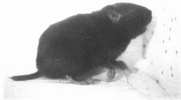
FIG. 1. Male Spalacopus cyanus from Lagunillas, Andes of central Chile.

FORM AND FUNCTION. Fossorial adaptations of S. cyanus