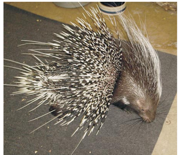
FIG. 1. Photograph of a 9-month-old male Cape porcupine ( Hystrix africae australis ) at Peoria’s Glen Oak Zoo, Peoria, Illinois.

GENERAL CHARACTERS. Adult H. africae australis range from 10.0 to 24.1 kg and are not sexually dimorphic (Smith-