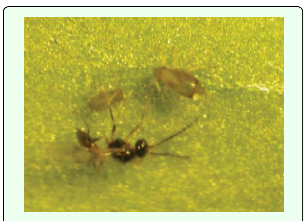
Video 2. An Aphis fabae nymph kicks away a droplet of honeydew using its hind tarsus. High quality figures and videos are available online.