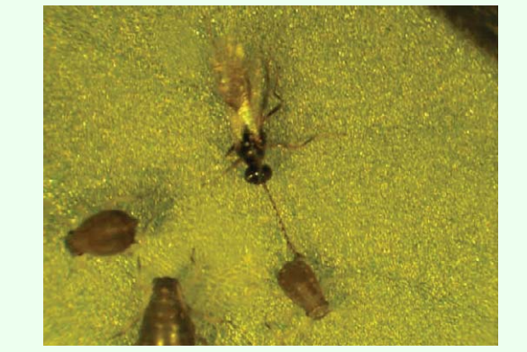
Video 6. Death of a female Lysiphlebus fabarum following adhesion of one antenna to a droplet of Aphis fabae cornicle secretion (condensed sequence). High quality figures and videos are available online.

This particular strain of L. fabarum exploited A. fabae as a source of both food and hosts, and the time females allocated to honeydew solicitation was affected by the females'