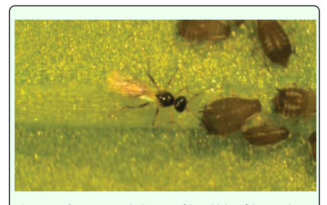
Video I. Antennation behavior of Lysiphlebus fabarum during solicitation of honeydew from Aphis fabae . High quality figures and videos are available online.