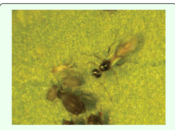
Video 3. An Aphis fabae nymph withdraws a droplet of honeydew when it is overlooked by an L. fabarum female following presentation. High quality figures and videos are available online.