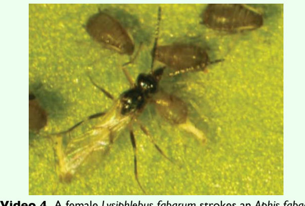
Video 4. A female Lysiphlebus fabarum strokes an Aphis fabae nymph with its antennae during ovipositor insertion. High quality figures and videos are available online.

As previously reported by Völkl and Stary (1988), aggregations of females more or less continuously interacting with one another on the ceilings of cages and rearing containers were often observed. These interactions involved antennation, abdominal bending, and probing with the ovipositor. The probing