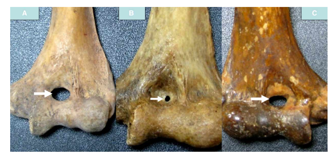
Figure 1. Photograph showing A: oval type of supratrochlear foramen; B: round type of supratrochlear foramen; and C: triangular type of supratrochlear foramen.

the presence of variations like STF in the distal end of the humerus.