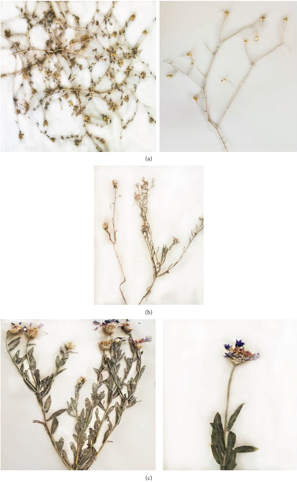
FIGURE 1: Some Centaurea species deposited in the herbarium of the Faculty Of Pharmacy, Tehran University of Medical Sciences. (a) Centaurea bruguierana . (b) Centaurea patula . (c) Centaurea depressa .