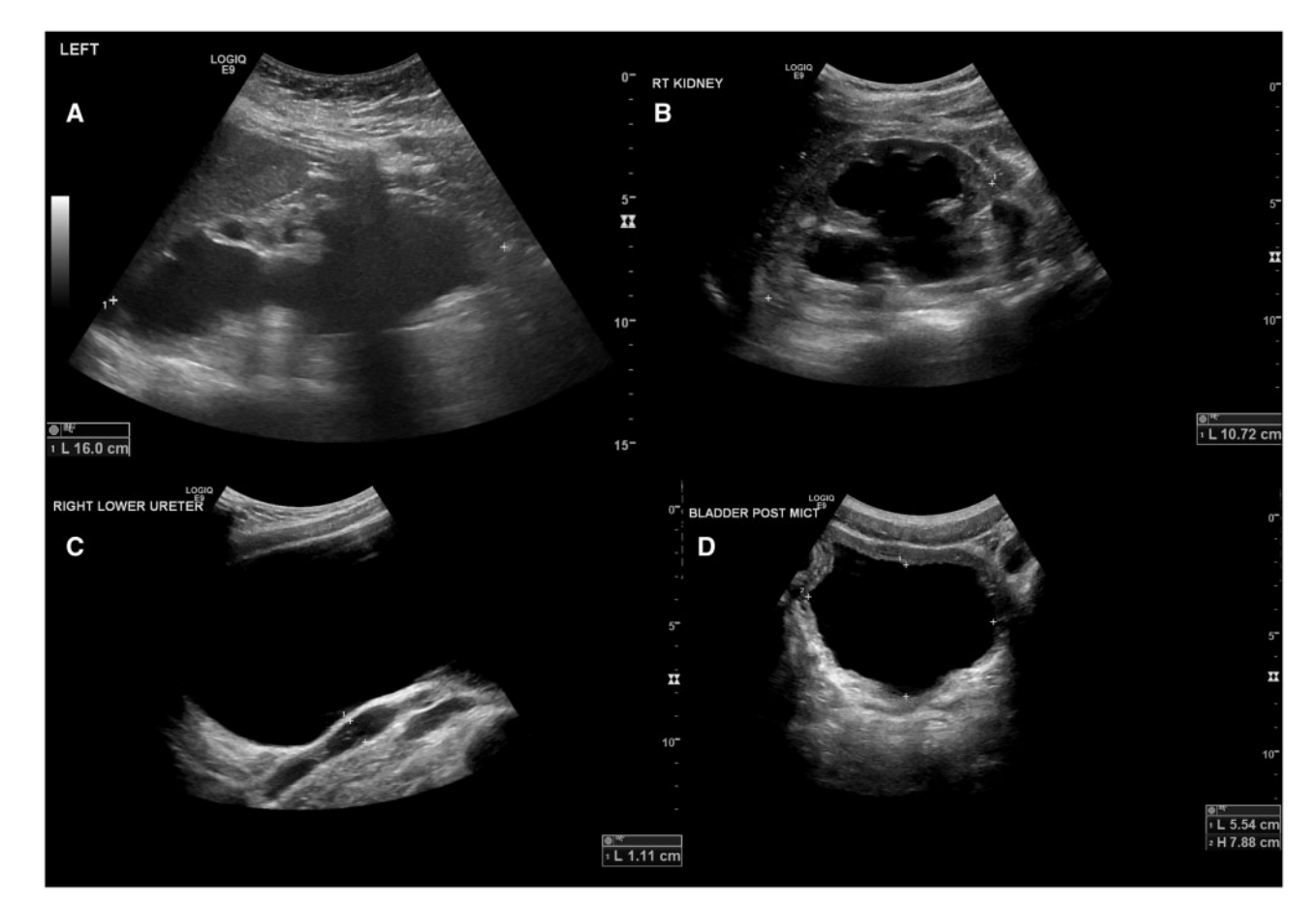
FIGURE 2: Examples of flow uropathy. Shown are ultrasound images detailing flow uropathy. (A) Marked hydronephrosis of single right kidney with loss of renal cortex in Patient 22 (at age 17 years). (B) Hydronephrosis, (C) Dilated bladder and ureter, (D) PVR in Patient 2.1 (all images at age 15 years). Hydronephrosis in this patient developed after the age of 8 years.