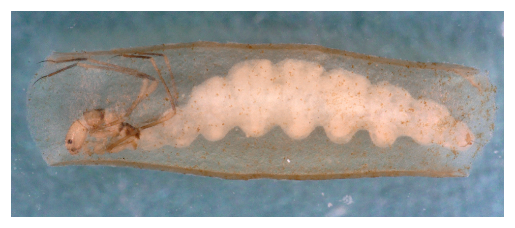
Figure 7. Larvae of Tricholeiochiton fagesii (Guinard, 1879) (Hydroptilidae) in its case.