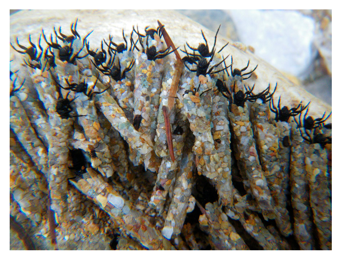
Figure 12. Larvae of Allogamus auricollis (F.J. Pictet, 1834) (Plenitentoria: Limnephilidae) filtering FPOM with their hairy legs.

The many different ways that the tube-case-making Integripalpia feed are indicated in Table 1. Shredding detritivory is common, as many species, especially in Plenitentoria, consume mostly the same kinds of leaves or wood with which they construct their cases [102–104]. Larvae of some species of Plenitentoria also eat animal tissue, shredding and ingesting living insects and vertebrate eggs as predators (e.g., Phryganeidae: Banksiola, Oligostomis, Oligotricha, Phryganea, Ptilostomis; Lepidostomatidae: Lepidostoma [21,27,28,105,106]) or cannibals (e.g., Limnephilidae: Asynarchus [107]) or scavengers (e.g., Lepidostomatidae: Lepidostoma; Limnephilidae: Dicosmoecus, Psychoglypha [108]). An interesting parallel development in Integripalpia is filter feeding; whereas Annulipalpia larvae commonly use silken filter nets to remove FPOM from suspension, larvae of some Plenitentoria, such as Brachycentrus spp. (Brachycentridae) and Allogamus spp. (Limnephilidae), filter suspended FPOM with hairs on their legs (Figure 12).