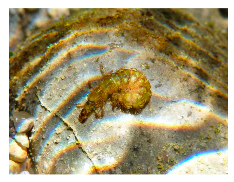
Figure 9. Larva of Rhyacophila sp. (Rhyacophilidae).

Larvae of Rhyacophilidae and Hydrobiosidae (collectively "free-living caddisflies") are free-living and campodeiform, usually feeding as predators that pursue their prey (Figure 9). Their last larval instar assembles a fixed, dome-like shelter of stones and silk, under which it spins a semipermeable silken cocoon and pupates within it [28,101]. In this way, the pupal shelters and cocoons of Rhyacophilidae and Hydrobiosidae resemble those of Glossosomatidae [28].