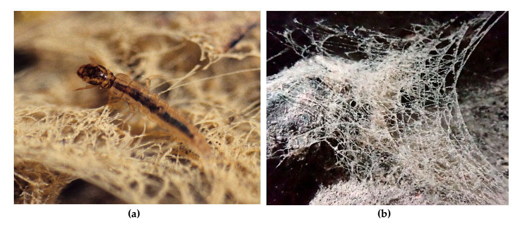
Figure 6. (a): Larva of Plectrocnemia conspersa (Curtis, 1834) (Polycentropodidae). (b): Capture net of P. conspersa . Both figures © W. Graf.