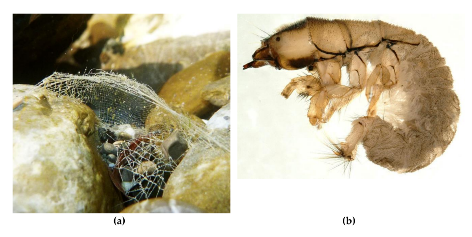
Figure 3. (a): Filter net and gravel retreat of Hydropsyche sp. (Hydropsychidae) between large stones.(b): Larva of Hydropsyche bulgaromanorum Malicky, 1977 (Hydropsychidae). Both images © W. Graf.

the outflowing water constrained by a downstream exit tube (e.g., Macrostemum spp. [86]). For either architectural arrangement, the net is spun transversely across the current, with mesh sizes varying among the different genera and species in correlation with current speeds and sizes of food particles typically consumed by those taxa [85–88].