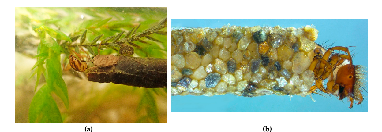
Figure 10. (a): Larva of Oligostomis reticulata (Linnaeus, 1761) (Plenitentoria: Phryganeidae) in its case composed of pieces of angiosperm leaves; © W. Graf. (b): Larva of Drusus sp. (Plenitentoria: Limnephilidae) in its case composed of gravel; © S. Vitecek.

Larvae of all Integripalpia in infraorders Plenitentoria (Figure 10) and Brevitentoria (Figure 11) construct portable cases that are essentially tubular in design, usually with discernible anterior and posterior ends. The cases are of a wide variety of shapes and are constructed with different materials and in different arrangements that are generally distinctive for the taxon. They live in such cases throughout their larval existence, usually adding case material to the gradually enlarging anterior end and usually cutting away and discarding case material from the narrower posterior end as they grow. The posterior end of the case commonly has a silken membranous sieve to protect the larva from intruders but allowing the flow of water through the case for respiration [28].