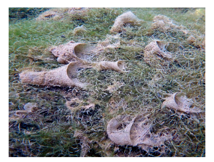
Figure 5. Capture nets of Neureclipsis sp. (Polycentropodidae).