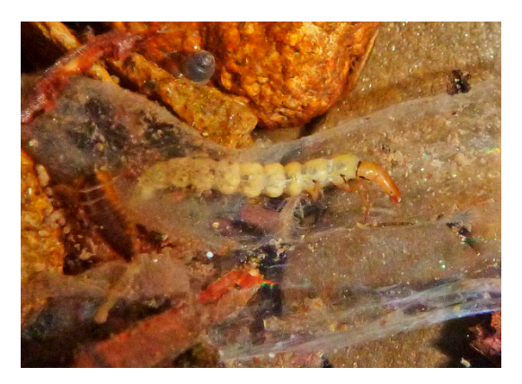
Figure 4. Larva of Wormaldia sp. (Philopotamidae) in its filter net.

Larvae of the next oldest extant lineage of Annulipalpia, the ancestor of the Philopotamidae ("finger-net caddisflies") and Stenopsychidae, also filtered suspended organic particles from flowing water. Modern Philopotamidae larvae typically spin capture nets in slowly moving water, usually on the undersides of stones, with the smallest mesh openings recorded for Trichoptera [89]. The philopotamid net has no separate retreat, as a larva occupies all of a single sac-like or finger-like net. The net is attached to the substrate only at its anterior, upstream end, often with small pebbles around this entrance to help keep it open. The remainder of the net is unrestrained and wafting gently in the current with a smaller opening at the posterior end (Figure 4) [89]. Stenopsychidae make loosely woven retreats/capture nets in fast-flowing water, with three different parts of the capture-net portion serving as: (1) a cover, (2) a primary feeding mesh, and (3) a pocket for collecting seston (minute living and nonliving FPOM suspended in moving water); the retreat portion is beside the latter [90].