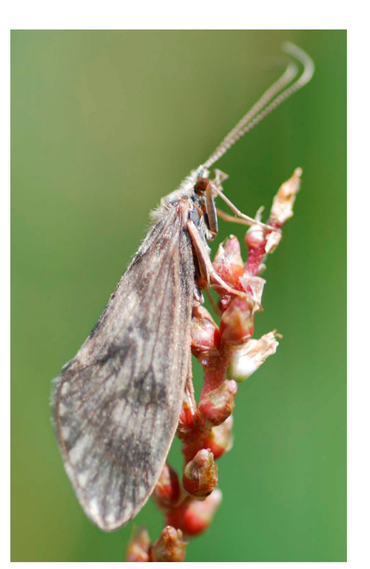
Figure 1. Adult of Brachycentrus americanus (Banks, 1899) (Brachycentridae).