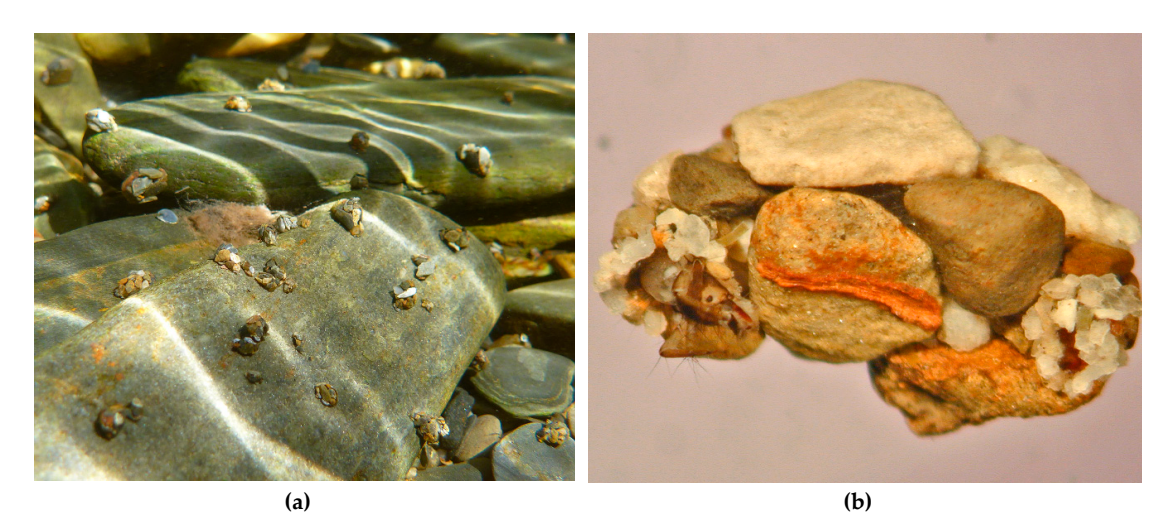
Figure 8. ( a ): Larvae of Glossosomatidae grazing epilithic periphyton from large stones. ( b ): Larva of Synagapetus sp. (Glossosomatidae) in its case.

Larvae of Rhyacophilidae and Hydrobiosidae (collectively "free-living caddisflies") are free-living and campodeiform, usually feeding as predators that pursue their prey (Figure 9). Their last larval instar assembles a fixed, dome-like shelter of stones and silk, under which it spins a semipermeable silken cocoon and pupates within it [28,101]. In this way, the pupal shelters and cocoons of Rhyacophilidae and Hydrobiosidae resemble those of Glossosomatidae [28].