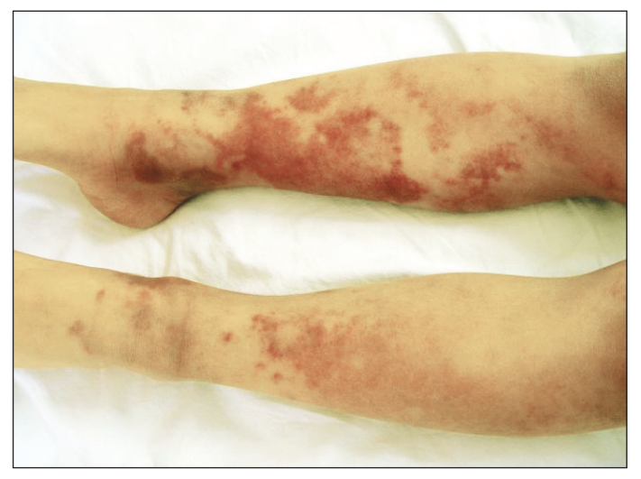
Figure 2: Red and purple-colored, slightly infiltrated, geographic patterned ecchymotic patches in various sizes on below-knee region.

ASS lesions are characterized by sudden onset, pain, swelling, bleeding, and variable size, and can occur on the skin of any part of the body [8]. The lesions vary in size from 1-2 cm in diameter to involvement of an entire limb. The lesions typically occur on the extremities and rarely on less accessible locations, such as the back. The lesions are preceded by parasthesia or pain [5]. The lesions are recurrent, usually resolving within a period of 2 weeks [7].