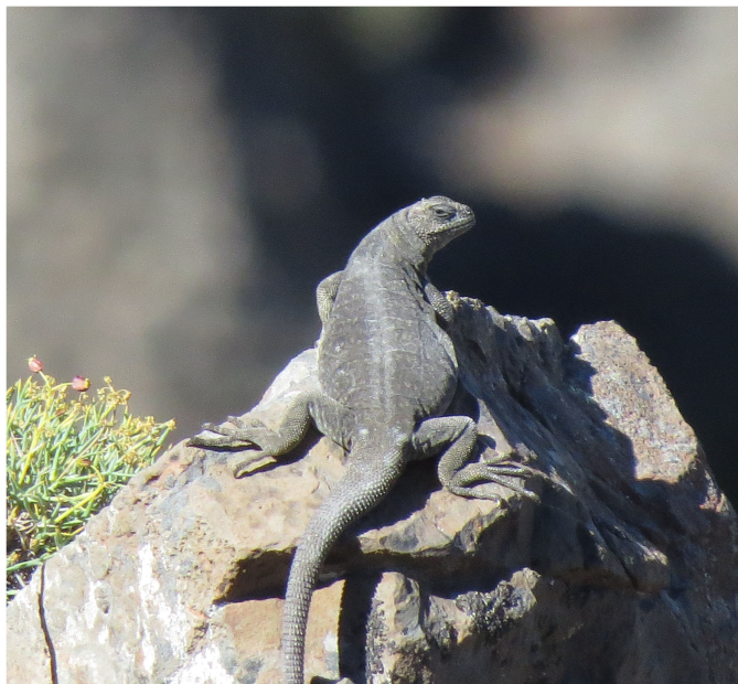
Figure 1 Adult of Phymaturus tenebrosus .