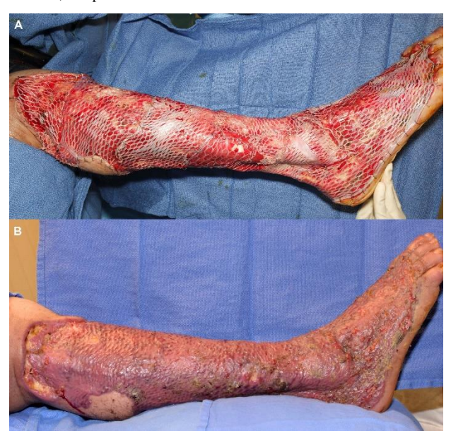
Figure 4. Split thickness skin grafting of right lower leg, (a) on-table result and (b) postoperative day 29.

The ensuing history of silicone injection has followed a cyclical course of legitimization through quality control of product and administration, disappointingly poor new outcomes, further restriction of indications, and qualified successes causing renewed expressions of concern in the