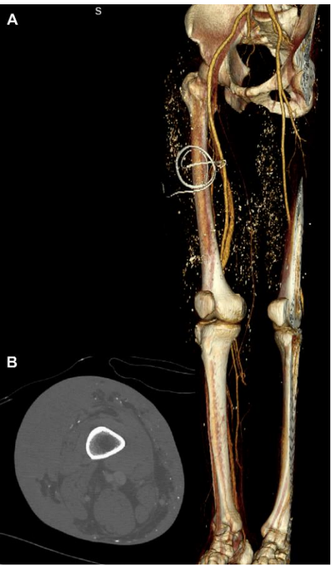
Figure 1. Computed tomography (a) three-dimensional reconstruction and (b) axial slice showing extensive lower extremity subcutaneous tissue infiltration with calcified granulomas and obliteration of fat, and sparing of muscular compartments.

subcutaneous tissue below the knee, sparing the plantar surface and toes, followed by negative pressure wound therapy. Pathology showed ulceration, extensive fibrosis, deep tissue necrosis, and numerous cystic spaces, some containing amorphous, refractile foreign material, compatible with silicone (Figure 3). No bacterial or fungal elements were identified within the tissues, and tissue cultures were negative. Five days after resection, the patient underwent meshed split thickness skin grafting of the affected area from donor sites on the back. The graft had nearly 100% take and, following a period of rehabilitation, the patient was able to ambulate (Figure 4).