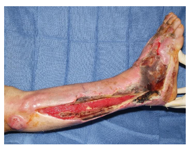
Figure 2. Epidermolysis of chronically fibrotic and inflamed skin after silicone injection.