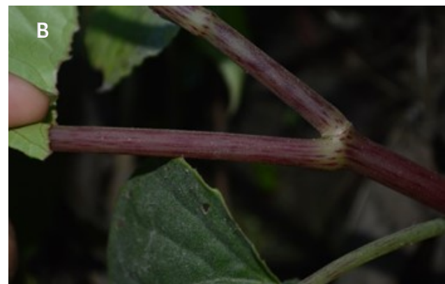
Figure 1 | Begonia roxburghii . A. Leaves. B. Stem