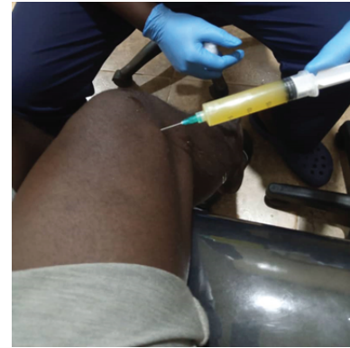
Figure 3. Macroscopy aspect synovial fluid

visited the internal medicine out clinic. During the interview, the patient denied any relevant medical history, apart from episodes of right knee swelling. There are no records of fever, diarrhea, constipation, skin changes or hair loss, nor are there reports of urethral discharge, lower back pain or pain in another joint, except for one episode of inflammation of the right ankle. In the general physical examination, he appears well, does not present any discomfort, walks with difficulty, and has functional limitations in the right knee due to increased joint volume. Despite the chronicity of the problem, he appears to be in good general health.