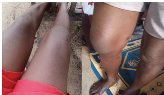
Figure 1. Swelling in the right knee.

The treatment in all episodes remains similar, as well as the response to it. Characterized by continued progressive improvement until returning to normal, and without functional or anatomical repercussions. This condition was perpetuated over five years, with identical regularity over every six months. The swelling, and inflammation in the right knee returned, making attacks habitual, a study of the synovial fluid was carried out, which showed and unspecific inflammatory process, but was not conclusive. Frustrated by the chronicity, recurrence, and regularity of the disease, he