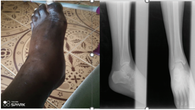
Figure 2. Swelling in the left ankle.