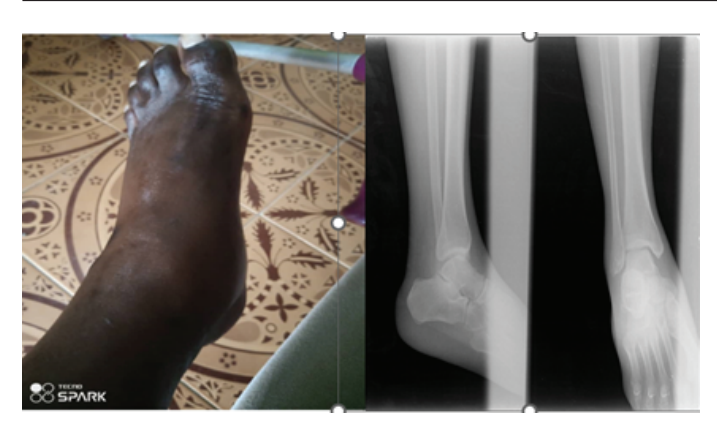
Figure 2. Swelling in the left ankle.

visited the internal medicine out clinic. During the interview, the patient denied any relevant medical history, apart from episodes of right knee swelling. There are no records of fever, diarrhea, constipation, skin changes or hair loss, nor are there reports of urethral discharge, lower back pain or pain in another joint, except for one episode of inflammation of the right ankle. In the general physical examination, he appears well, does not present any discomfort, walks with difficulty, and has functional limitations in the right knee due to increased joint volume. Despite the chronicity of the problem, he appears to be in good general health.