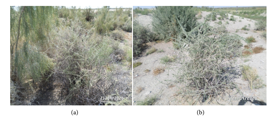
Photo 2. (a) Haloxylon persicum formation; (b) Tamarix hispida formation.