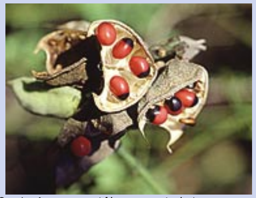
Seeds of rosary pea (Abrus precatorius)

Seeds of rosary pea ( Abrus precatorius ) are unusual in that they are mimetic, a trait shared with the native coral bean ( Erythrina herbacea ). The glossy, hard seeds are bright red, and not surrounded by pulp or skin. Instead, they mimic fleshy-pulped fruits in a game of deception, taking advantage of frugivorous birds to disperse their seeds with no compensatory reward.