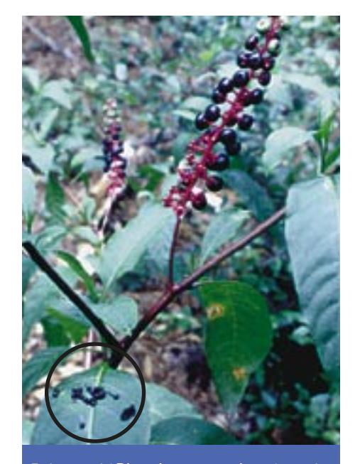
Pokeweed ( Phytolacca americana ) seeds left on the parent plant by a masher, the northern cardinal ( Cardinalis cardinalis )

Murray et al. (1994) showed that there is a positive correlation between the distance over which a seed is dispersed and the length of time that a bird carries the seed. Thus, the mechanism of voidance can influence rates of expansion of plant populations because regurgitation is usually much quicker than defecation. Meyer and Witmer (1998) found that after fruit consumption by American robins, the mean seed defecation time of the