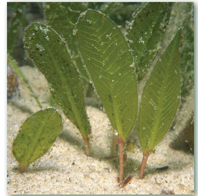
Halophila ovalis in Moreton Bay, Australia.

Seagrasses protect the coast by trapping and stabilizing marine sediments, raising the seafloor at rates of 0.04 inch (1 mm) per year. They dissipate wave energy and shelter the coast from storms.