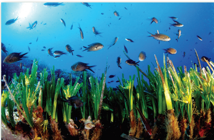
Posidonia oceanica in the Mediterranean Sea.

Seagrasses grow under sea ice as well as adjacent to coral reefs. They live in shallow water along exposed coasts and in sheltered lagoons and estuaries.