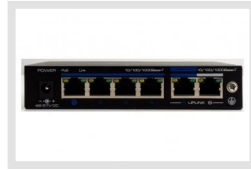
IAD-5SG1004MUA | SKU: 216469