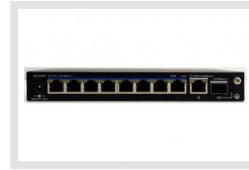
IAD-5SG1008MUA | SKU: 216472