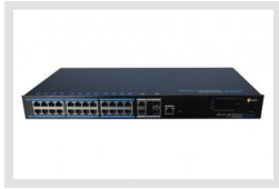
IAR-7SE1024MMA | SKU: 214460