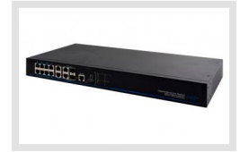
IAR-7SG1008MMA | SKU: 216473