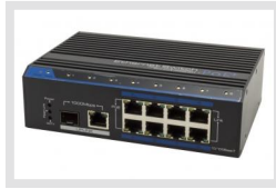
IAM-5SE1008MUA | SKU: 214459