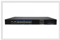
IAR-7SG1016MMA | SKU: 216474