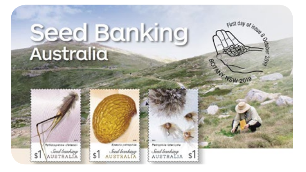
The Seed Banking in Australia release will feature three $1.00 stamps, first day cover, maxicard set, three booklets of ten $1.00 stamps and a booklet collection of the featured Australian native species. (Photo: Dan Duval, BGSH; Andrew Crawford, DBCA; Brook Clinton, ANBG and Sonia Young, Australia Post).

The Partnership has worked with Australia Post to develop a set of special-issue stamps for release in October 2019. The set of three stamps include seed images of Petrophile latericola from Western Australia; Rytidosperma clelandii from South Australia, and Epacris petrophila from the ACT. The stamps will be used to raise awareness of the importance of seed banking for Australia's threatened flora, and to draw attention to the significant collaborations nationally and internationally that help to secure native species in seed banks for future restoration and research. The seed stamps and associated products will be available for purchase from Australia Post outlets and online from 8 October 2019.