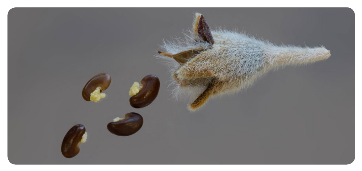
Gastrolobium mondurup seed and fruit taken with a tripod-mounted digital SLR camera with macro lens. Photos such as this one are taken with natural light and a remote is used to avoid camera shake. The seed and fruit are placed on a glass petri dish to provide a clear stage with no shadow, with a paint sample card providing a uniform background. A physical ruler can be included in the field of view or inserted to the image using imaging software. Some seeds require more depth to capture their various traits, and so imaging software can enable image stacking and can ensure these features are clearly visible.

During my time at the MRBG, I was involved in developing the gardens from a largely greenfield site into the world-class facility it is today. MRBG's collections were largely of the Central Queensland Coastal Bio-region and we often collected from the surrounding areas. My responsibilities included overseeing the herbarium, curating collections and developing the living collections database. I also had the pleasure of getting involved in areas as diverse as tropical sports turf trials with the then Queensland Department of Primary Industries and Fisheries; performing field surveys in Eungella with Griffith University; and becoming a key member in the BGANZ Botanic Records Officers Network.