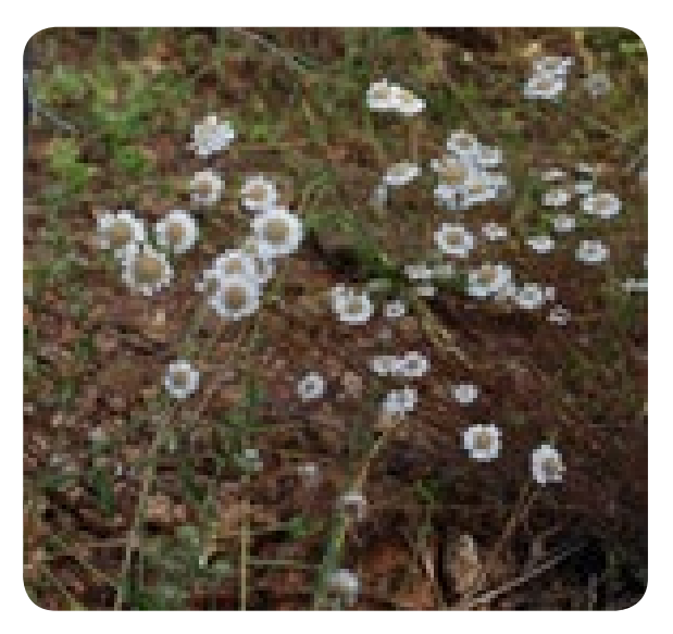
Rhodanthe collina in flower.