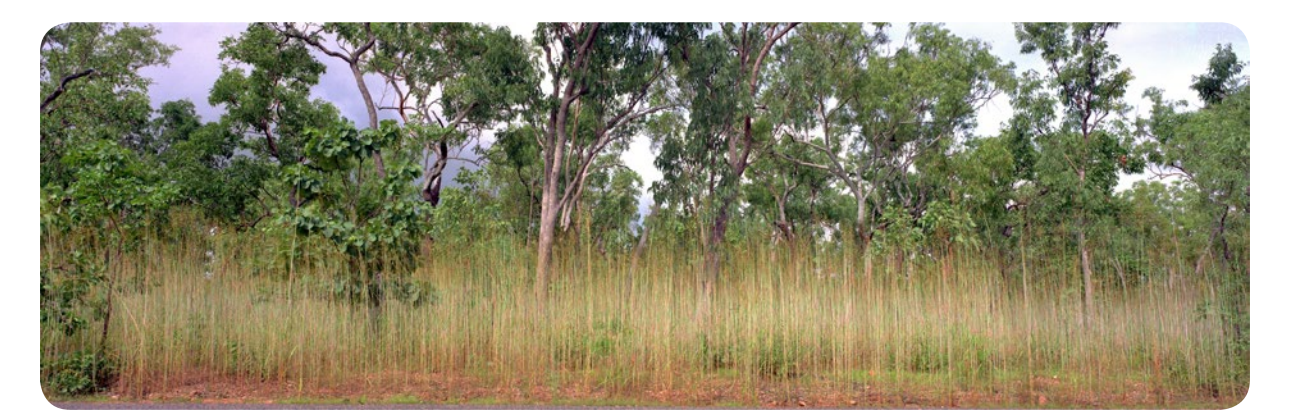
Many of the collections our Partners secure are sourced within a short distance of road verges, like this one on the Arnhem Highway in Kakadu. Roads provide ready access to various landscapes and can also present interesting finds, particularly as some species will be dispersed by vehicles while other species that respond well to disturbance can potentially establish new populations.