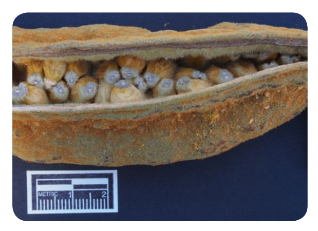
Resourcing for seed conservation covers a great diversity of activities – from collecting in the field to conducting research and capturing images of the incredible diversity of Australia's native species.

in botanic gardens provides a unique opportunity for the Partnership to develop multi-jurisdictional approaches to improve funding opportunities around the country. Over the next 12 months, we will be exploring ways to capitalise on the diversity of skills within the Partnership to improve our ability to conserve the diversity of the Australian flora through ex situ seed conservation.