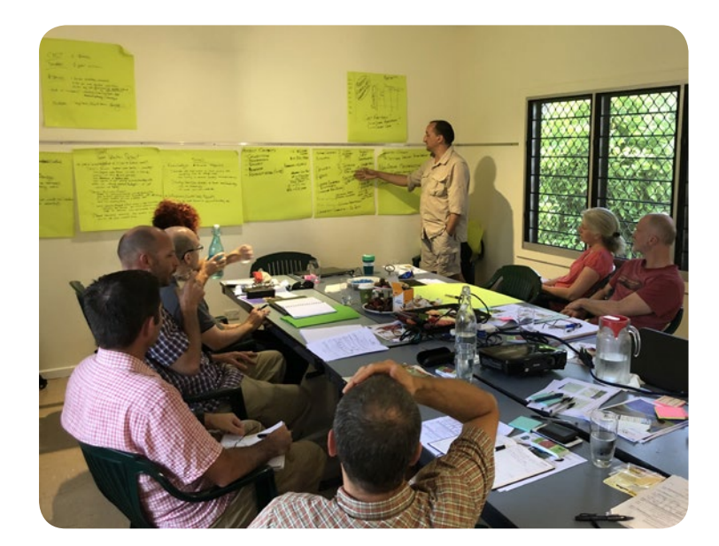
The 2019 face-to-face meeting of the Steering Committee involved several workshops to refine future priorities across seed banks and to identify possible options for projects that could be developed to deliver further collecting, research, data management and capacity building within the Partnership. (Photo: Damian Wrigley, ASBP).