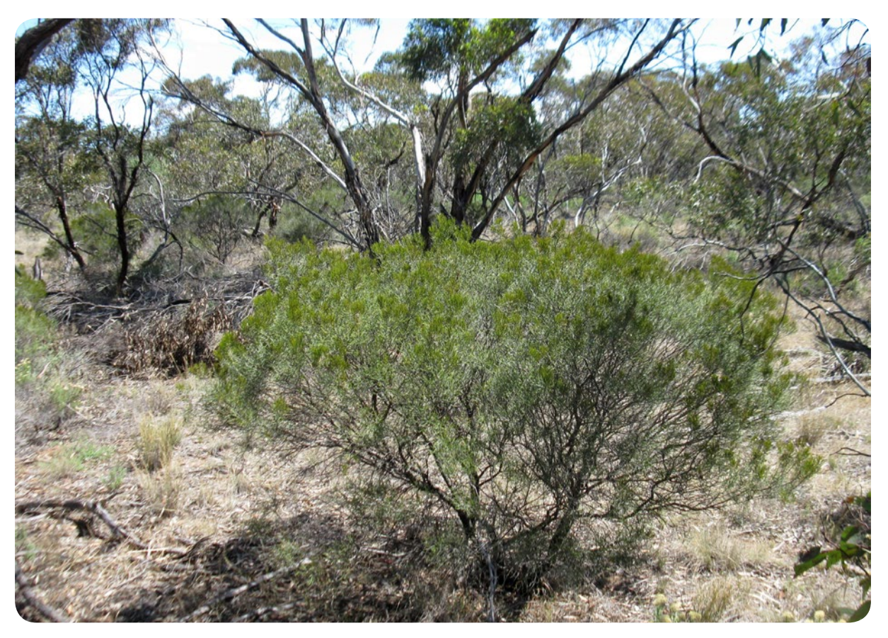
Acacia sp. aff. rigens (Gerang Gerung), Glenlee Flora and Fauna Reserve, western Victoria.

While undertaking fieldwork related to the description of a new, rare Acacia species in western Victoria, an opportunistic seed collection was taken. Fieldwork suggested that the yet-to-be-named species has been drastically reduced through extensive cereal cropping on better soils of the Wimmera, with populations now largely restricted to roadside remnants and two more extensive occurrences in conservation reserves at the very margins of the species range, adjacent to farmland. It is hoped that the collected seed can provide the basis for translocation into further suitable, safe sites within the highly modified Wimmera landscape.