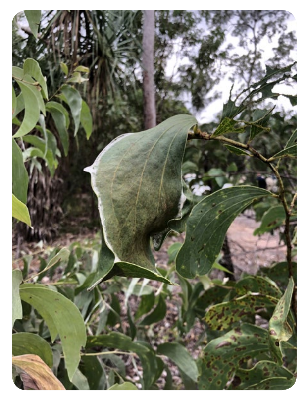
Acacia tolmerensis collected from Litchfield National Park in the Northern Territory. This collection was made with support from the Millennium Seed Bank Partnership's Global Trees Seed Bank Project. This individual's leaves were being used by Green ants, Oecophylla smaragdina to make a nest.

Collecting genetically diverse and representative collections from Australia's endemic and threatened species will continue to be a priority for the Partnership. Other priorities include: improving data management; continuing to contribute to guidelines and standards that support international best-practice seed conservation and research; and developing better linkages across the various sectors involved in seed conservation, including restoration, agricultural, and cultural seed and gene banking both within Australia and internationally.