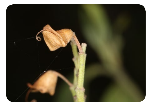
Mature capsule of Prostanthera petraea in Boonoo Boonoo National Park near Tenterfield, NSW

The new state-of-the-art facility will protect the Gardens' nationally and internationally significant collection of more than 1.4 million plant specimens. Currently housed in the Robert Brown Building, which has limited environmental controls, the herbarium collection was at risk from degradation, mould and insects. Additionally, with more than 8,000 new specimens being added to the collection every year, the storage will be at capacity by 2022.