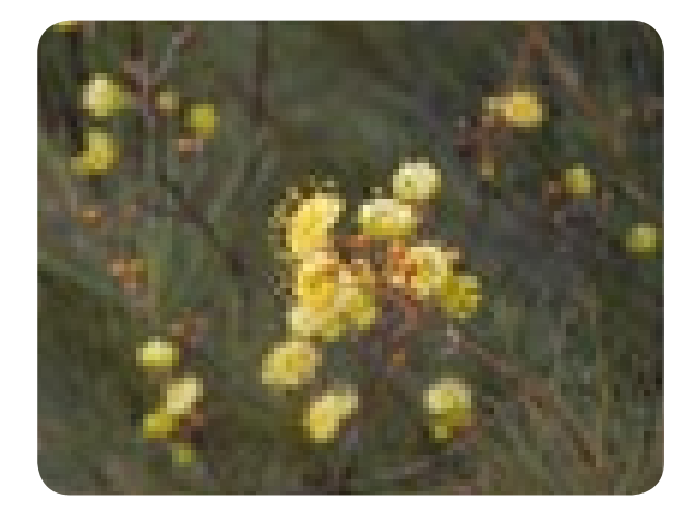
Grevillea gordoniana near Shark Bay, WA.

Persistence with the task will almost always yield a good result eventually.