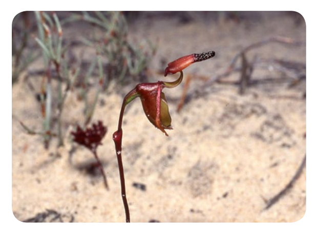
The critically endangered Black-beak duck-orchid ( Paracaleana disjuncta ) was collected from Cox Scrub Conservation Park by volunteers of the Native Orchid Society of South Australia.

These new collections have helped achieve an overall target of approximately 80 per cent of South Australia's threatened flora currently conserved in the Seed Bank. In addition, more than 40 seed collections were used to propagate plants for on-ground projects with SA Water, Natural Resources Adelaide, Natural Resources Adelaide and Mount Lofty Ranges, and Ecological Horizons on Eyre Peninsula.