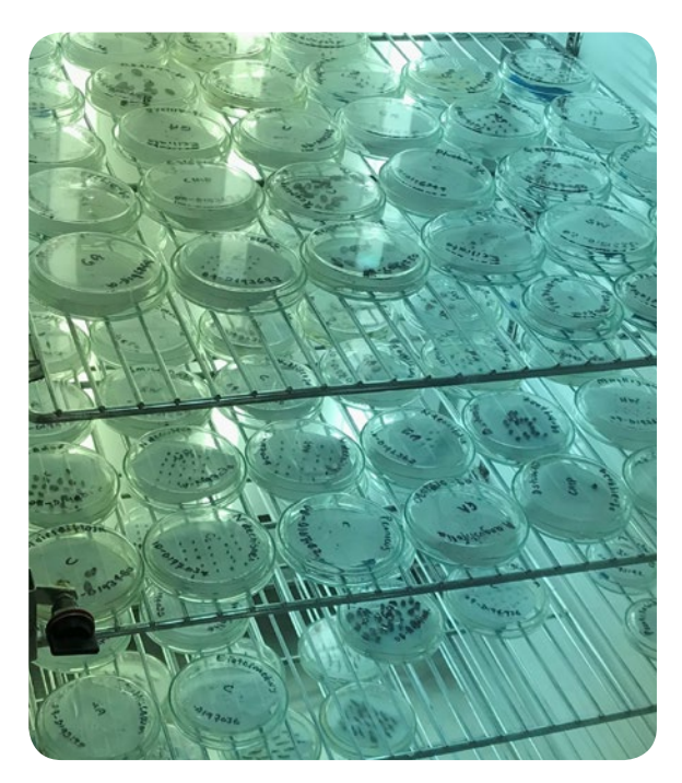
Storing seeds in the right conditions is crucial to ensuring their long term viability. Drying seeds to approximately 15% relative humidity and storing in foil bags at -18°C can help prolong the life of some seeds for many years. Germination testing is also important, as it helps seed conservation experts to know whether a seed collection is viable. In many cases, these tests can take several months as we attempt to understand what treatments are required in order to break either physiological or morphological dormancy.