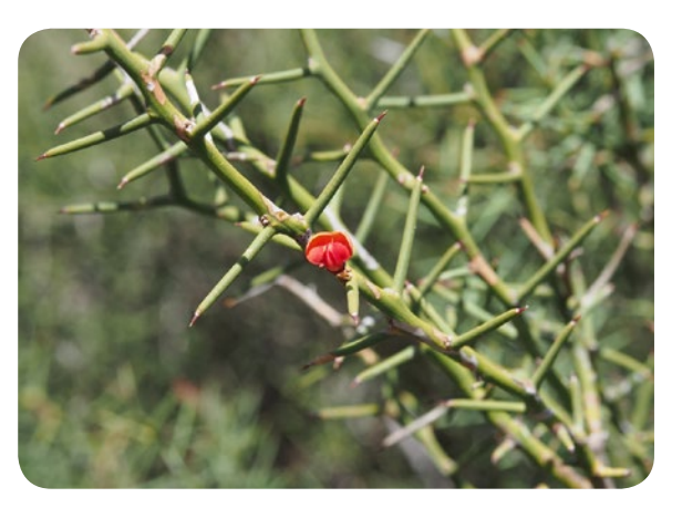
The endemic Daviesia schwarzenegger from Tarcowie which is currently known from fewer than a hundred plants. BGSH are using their seed collections to propagate plants in 2019 that will be used for recovery work in 2020.