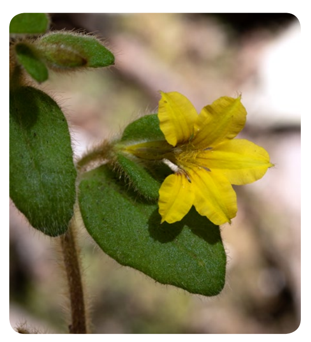
Scaevola xanthine remained elusive during this collecting season, with a population decline observed at Mount Manypeaks Nature Reserve. It is hoped that future collecting trips will result in a collection being made.

It wasn't far – around 300 metres as the crow flies – from the Banksia 's location to where over a thousand plants of the Scaevola had been recorded five years earlier.