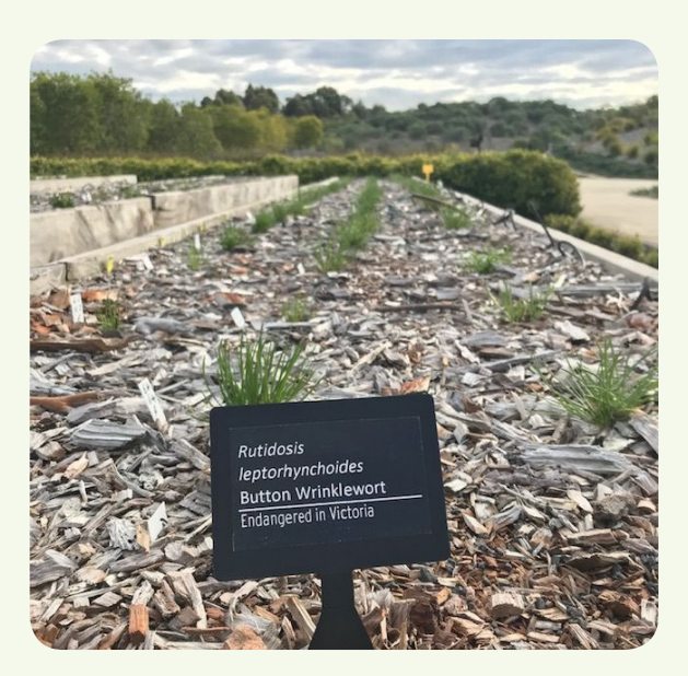
Rutidosis leptorhynchoides growing in experimental plots at Cranbourne Gardens.

This project is an opportunity to raise public awareness of the importance of ex situ seed conservation and the role of conservation horticulture. For further details regarding the first year of this project, see Hirst et al (2019) 'Raising Rarity: horticultural approaches to conserving Victoria's rare and threatened wildflowers'. Australasian Plant Conservation 27: 14-16.