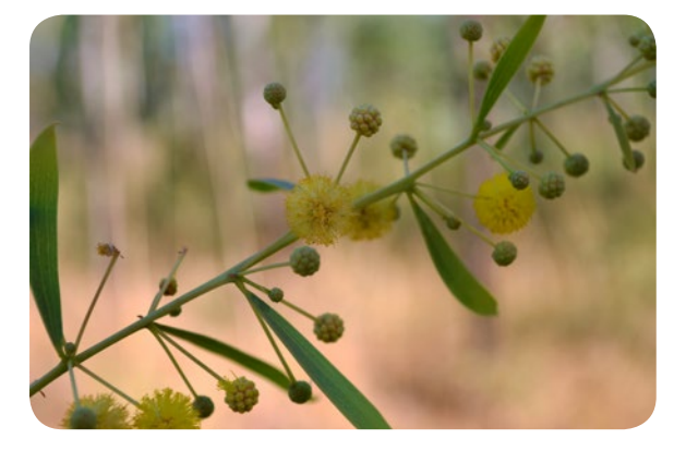
The golden flowers of Acacia sp. El Sharana located in Kakadu National Park in the Northern Territory. The species is often found in disturbed areas on track verges.

The Australian Seed Bank Partnership is supported by financial and in-kind contributions (e.g. scientific expertise, project management, fieldwork, information management, promotion and marketing) from partner and associate organisations, through philanthropic and public donations and the generous time commitment from many dedicated volunteers. Our business plan outlines our national program, which includes specific strategies, actions and timelines for achieving our vision: http://seedpartnership. org.au/about/reports.