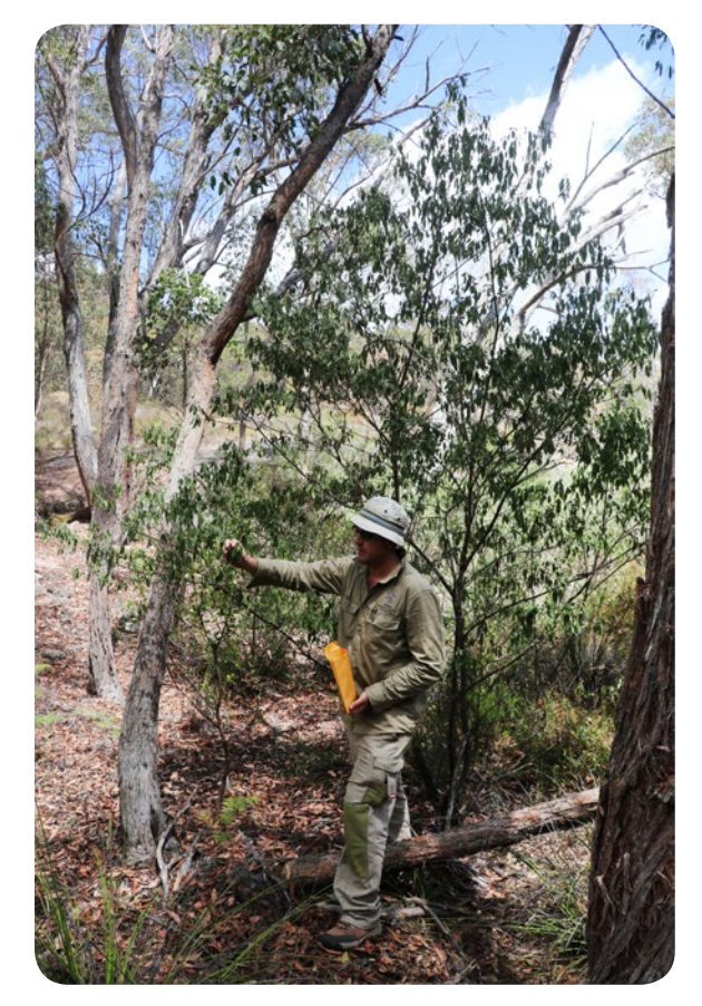
Seedbank Officer Gavin Phillips collecting Prostanthera petraea in Boonoo Boonoo National Park

A key feature of the new Herbarium will be six protective vaults made of thermal mass materials to shield the collection from bushfires and extreme temperature events. Inspiration for the Herbarium has been drawn from the seed pod of NSW's floral emblem, the iconic waratah.