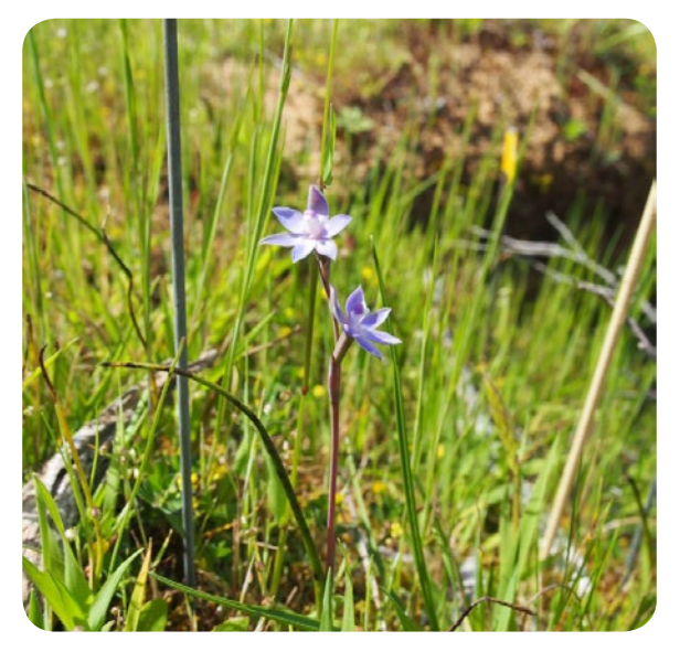
The South Australian Seed Conservation Centre has made collections of all three known subpopulations of the critically endangered blue-top sun-orchid ( Thelymitra cyanapicata ). The extant wild populations are currently estimated to be fewer than 200 individuals, so we grew-on seeds in the nursery and translocated 104 plants in July 2019.