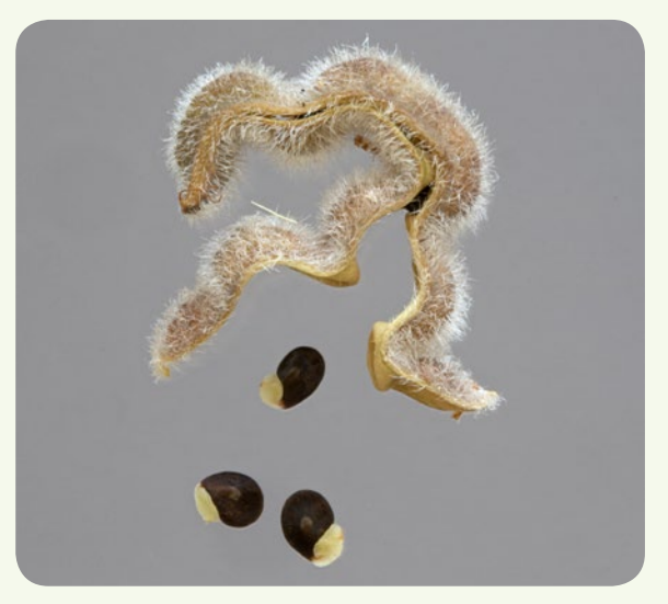
The seeds of Acacia prismifolia captured for cataloguing as a reference for the species. The variation among seeds of Acacia species can be significant, so images like these can help to identify species and to share knowledge about seed morphology.