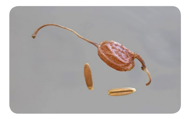
Grevillea olivacea seed and fruit

The role of the National Coordinator is to provide strategic leadership and program management to oversee the implementation of the Partnership's business plan, policy and operations. The Coordinator works with the members of the Partnership to secure the necessary funds for operations and programs that will realise the business plan for the Partnership.