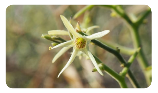
Anthocercis anisantha ssp. anisantha is endemic to South Australia, found in the central and northern Eyre Peninsula. The species grows in Triodia hummock grassland on the rhyolitic-porphyritic hills of the Gawler Ranges and on isolated hilltops further south.

A national effort to conserve Australia's native plant diversity through collaborative and sustainable seed collecting, banking, research and knowledge sharing.