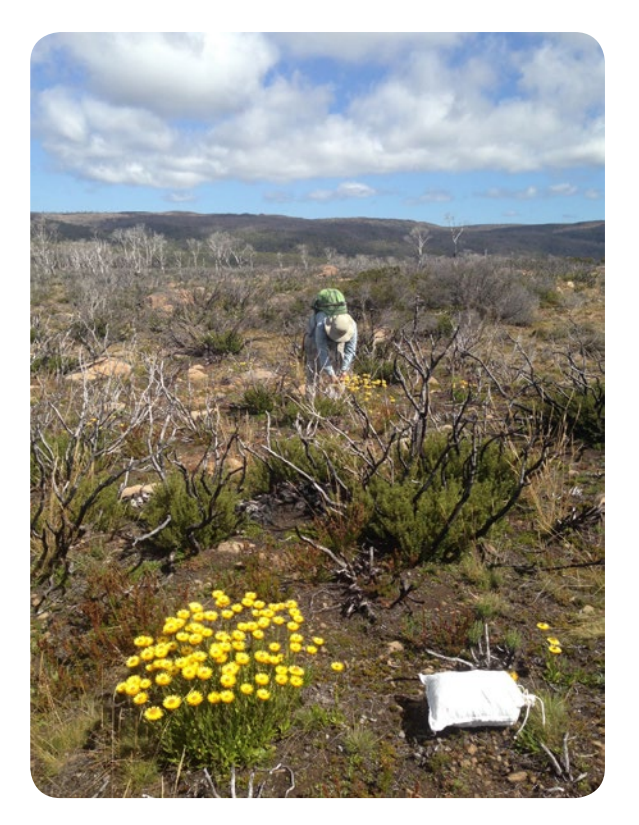
RTBG Horticultural Botanist Natalie Tapson collecting Asteraceae near Lake Mackenzie in the Central Plateau Conservation Area. Five daisies were collected from the site – Xerochrysum alpinum, Xerochrysum subundulatum, Celmisia asteliifolia, Coronidium monticola and Olearia myrsinoides.

The collecting season closed with a particularly fruitful trip to Lake Mackenzie, an area impacted by a major fire in 2016. This trip collected five species of daisies, including the recently described endemic Xerochrysum alpinum , and the alpine fire ephemeral Veronica nivea . These six collections contributed half of the total seed harvested this season, with a combined total of 540,000 seeds.