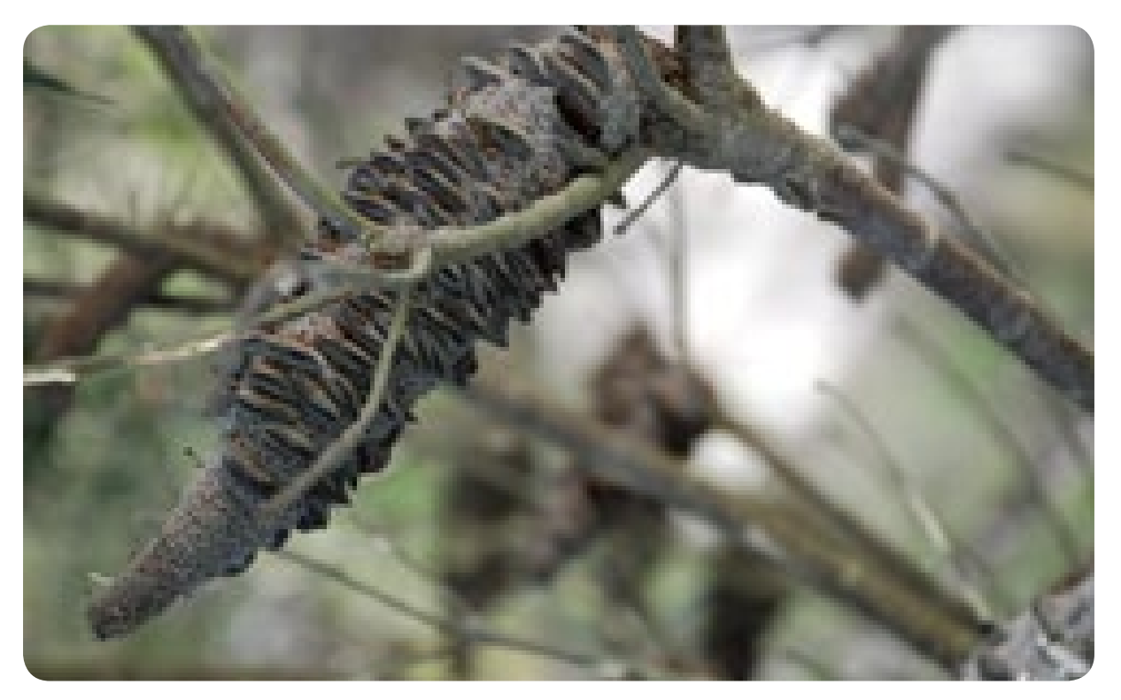
Banksia seminuda near Denmark WA, December 2018.