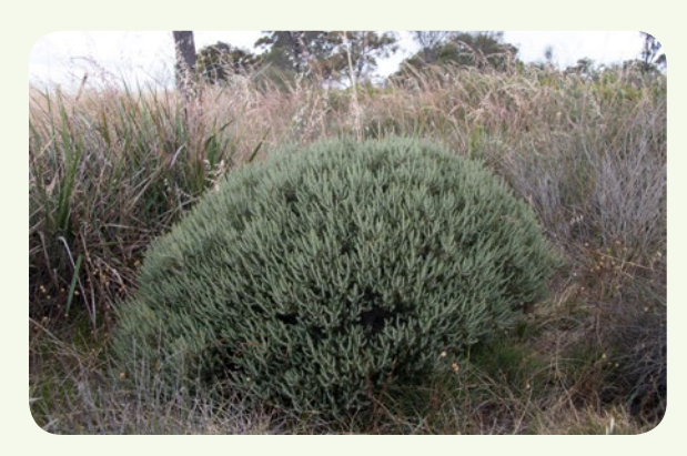
Acacia prismifolia was rediscovered by chance on the side of a country road in Western Australia. Many species are collected on roadways throughout Australia, illustrating how important even significantly modified habitats can be for threatened species.

News of the exciting find was brought to the attention of Andrew Crawford at the Department of Biodiversity, Conservation and Attractions' Western Australian Seed Centre. Andrew added the Acacia to his seed collection target list. The Acacia 's location was visited in November and several small, localised populations of the Acacia were found. The plants had immature fruit so seed capture bags were placed over fruit to catch mature seed when it was shed from the plant. These bags were retrieved in January 2019, and seed collections from each of the populations are now safely stored in the Western Australian Seed Centre.