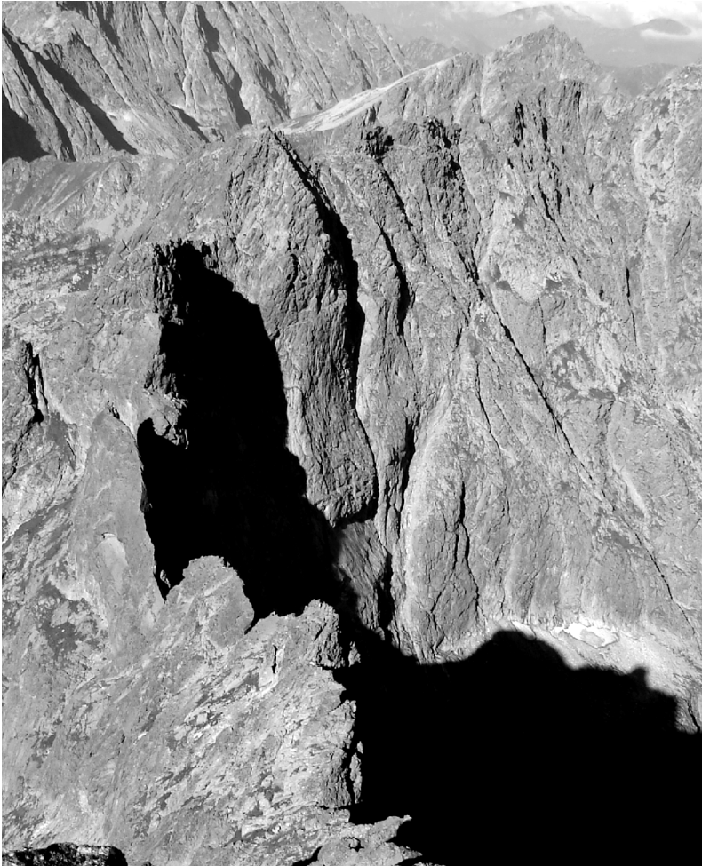
Fig. 1. Mt. Wolowy Grzbiet — a part of the main area of the subnival belt by Morskie Oko cirque in the Polish Tatra Mts.

of the Tatra Mts. and about 2300 m a.s.l. on the southern slopes up to the highest peaks (Gerlachovský štít ca. 2654 m a.s.l.) (see Pawłowski 1977a, Piękoś-Mirkowa & Mirek 1996). It more or less corresponds to the cold climatic belt with a mean annual air temperature varying between -4 and -2 °C (Hess 1996). Despite its relatively small area (Balon 2000), the subnival belt of the Tatra Mts. is a major natural peculiarity in the Carpathians; its lichens, however, remained underexplored for a long time.