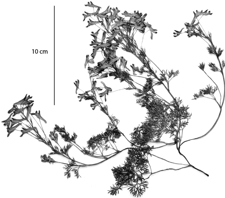
Fig. 1. Corydalis anthocrene (holotype).

decreasing in size upwards; ultimate leaflets cut into narrowly oblanceolate to linear acute somewhat channelled rather stiff lobes, 3–8 mm long. Leaf-lobes not held in one plane, but spreading in three dimensions, giving leaf a very crispy appearance. Principal racemes 10- to 15-flowered, lateral ones 4- to 10-flowered. Lower bracts like upper leaves, three times ternately (to subdigitately) deeply cut into linear acute segments, 10–15 mm long; uppermost bracts smaller and less divided. Lower and middle pedicels 30–45 mm, suberect in flowering stage. Sepals small, deeply lacerate-dentate, 1 \times 1\text{--}1.5 mm, whitish. Corolla brilliant blue; inner petals whitish with blue apical third (especially dorsal crests); outer petals subacute, narrowly crested; upper petal 15–16 mm long with slightly tapering obtuse almost straight spur 7–9 mm; nectary rather thin, reaching to 2/3 into spur; lower petal ca 9 mm with short claw rather abruptly expanding into a broad rhombic limb ca. 6 mm broad. Inner petals 7 mm long. Ovary with ca 12 ovules; style 3.5–4 mm, apically sharply curved and slightly swollen. Stigma distinctly broader than long, small (1 mm broad) with four apical papillae and geminate lateral and basal papillae on both sides; basal papil-