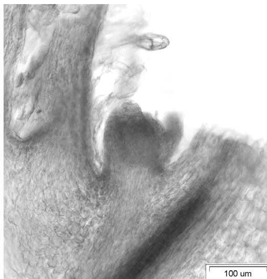
Fig. 3. Helichrysum yurterianum (from holotype). Longitudinal section of vegetative bud.

According to the classification by Anon. [Soil Survey Staff] (1998) and Altınbaş (2000), the soil in the area belongs to the widespread group "Lithic Xeric Torriorthent". Soil depth is ca. 30 cm and without horizons. The soil is yellowish-brown, compact, with stone, silt and clay, and offers a weak reaction with HCl acid (Table 2). It is medium-structured, capable of water retention and with capillary roots countable per square decimetre (Table 2). The roots of H. yurterianum were observed to branch freely in all directions. Ca and Mg values of exchangeable cations are high (Table 2). High Ca and \text{CaCO}_3 are features of the soil class "Lithic Xeric Torriorthent" and because the total annual precipitation is rather low, the Ca and carbonate cannot be leached out. The organic content is moderately high (Table 2)