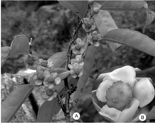
Fig. 2. Schisandra parapropropinqua in natural habitat. — A: Staminate flowering branch. — B: Close-up of staminate flower.