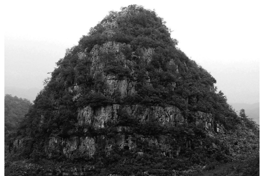
Fig. 4. Natural habitat of Schisandra parapropropinqua . (photographed by Zhi-Rong Yang).

ADDITIONAL SPECIMENS EXAMINED (paratypes). — China. Guizhou Province, Anlong County, 1125 m, 15.VI.2005, Z. R. Yang & M. T. An 2 (PE), 1167 m, 15.VI.2005, Z. R. Yang & M. T. An 3 (PE), idem., 1100 m, 24.V.2005, M.T. An 2004033 (PE), idem., 1180 m, 19.V.1960, Z. S. Zhang & Y. T. Chang 3605 (PE), idem., 1200 m, 26.V.1960, Z. S. Zhang & Y. T. Chang 3926 (IBK, PE, WUK), idem., 1100 m, 27.V.1960, Z. S. Zhang & Y. T. Chang 3960 (IBK, NAS, PE, WUK), idem., 1100 m, 11.VI.1960, Z. S. Zhang & Y. T. Chang 5063 (HGAS, NAS, PE, WUK), idem., 1100 m, 12.VI.1960, Z. S. Zhang & Y. T. Chang 4336 (NAS, PE, WUK), idem., 1300