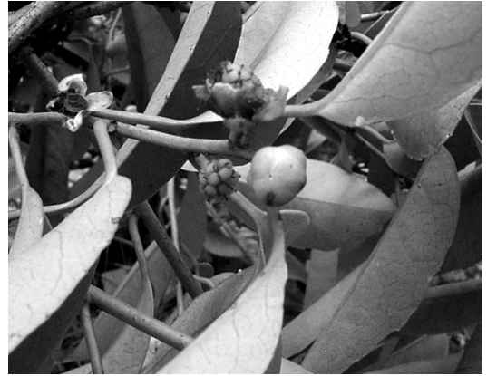
Fig. 3. Schisandra parapropropinqua in natural habitat. Pistillate flowering branch.

green or pink; outermost tepals smallest, elliptic to ovate, 0.6–5.0 mm long, 0.8–3.0 mm wide; innermost tepals nearly orbicular, obovate or widely elliptic, 5–15 mm long, 4–11 mm wide; peduncles 5–8 mm long. Male flowers with a red androecium of 9–13 stamens, fused into a carnosse mass, spherical, 3–6 mm in diameter, with sessile anthers; thecae on opposing sides of cavity, dehiscing towards each other. Female flowers with gynoeceum of 30–39 free carpels, gynoeceum spherical or ovoid, 4.0–6.0 mm in diameter; carpels 1.7–2.1 mm long, 1.0 mm wide. Pistillate peduncles not significantly elongated during fruiting; pistillate receptacles 4–16 cm long and not significantly thickened during fruiting; apocarps red, globose. Seeds 1–2 per apocarps, flattened-reniform, 3.0–4.0 mm long, 4.0–4.6 mm wide, 2.5–4.0 thick, pale brown; testa smooth, helium small, V-shaped. Flowering from May to July and fruiting from late July to September.