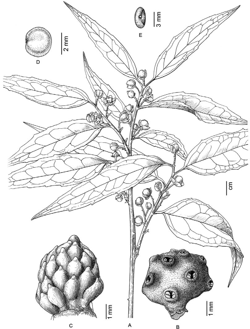
Fig. 1. Schisandra parapropinqua (drawn by Ying-Bao Sun). — A: Flowering branch (from Z. S. Zhang & Y. T. Chang 5063, PE). — B: Androecium (from Z. R. Yang & M. T. An 1, PE). — C: Gynoecium (from Z. S. Zhang & Y. T. Chang 6510, PE). — D: Seed in side view (from Z. S. Zhang & Y. T. Chang 6958, PE). — E: Seed in ventral view (from Z. S. Zhang & Y. T. Chang 6958, PE).

room of Beijing Botanical Garden, the Institute of Botany, Chinese Academy of Sciences.