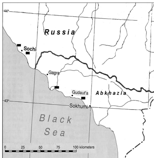
Fig. 2. Distribution map of Gyalecta titovii .