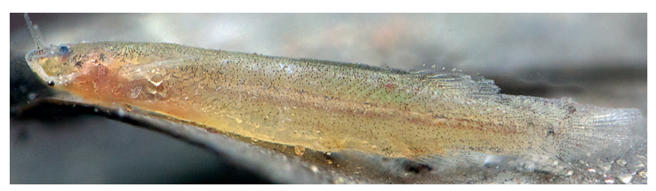
Fig. 2. Live specimen of Trichomycterus wapixana: UFRJ 8957; about 13.2 mm SL.