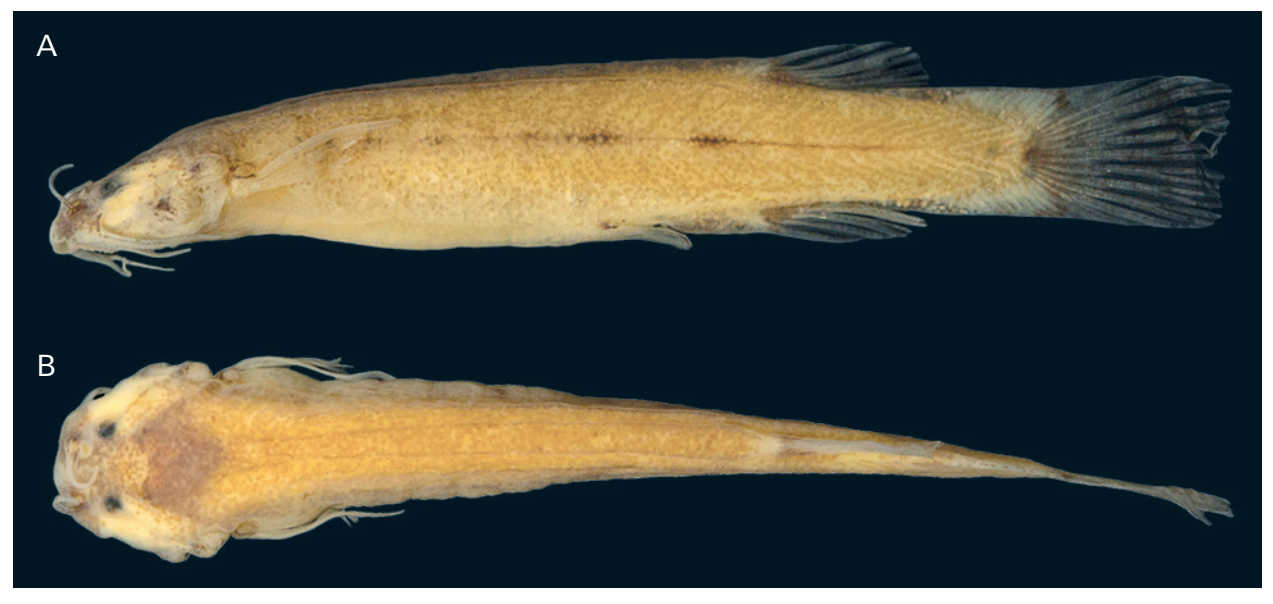
Fig. 1. Trichomycterus wapixana: UFRJ 10251, 14.0 mm SL (holotype): Tacutu river drainage. (A) lateral view; and (B) dorsal view.

a vertical between the base of the 17^{th} and 19^{th} vertebrae (vs. 15^{th} ).