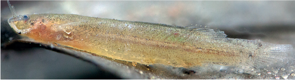
Fig. 2. Live specimen of Trichomycterus wapixana : UFRJ 8957; about 13.2 mm SL.