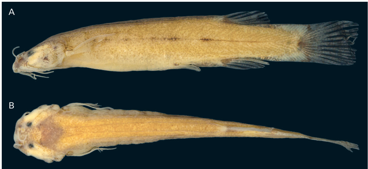
Fig. 1. Trichomycterus wapixana : UFRJ 10251, 14.0 mm SL (holotype): Tacutu river drainage. (A) lateral view; and (B) dorsal view.

a vertical between the base of the 17 th and 19 th vertebrae (vs. 15 th ).