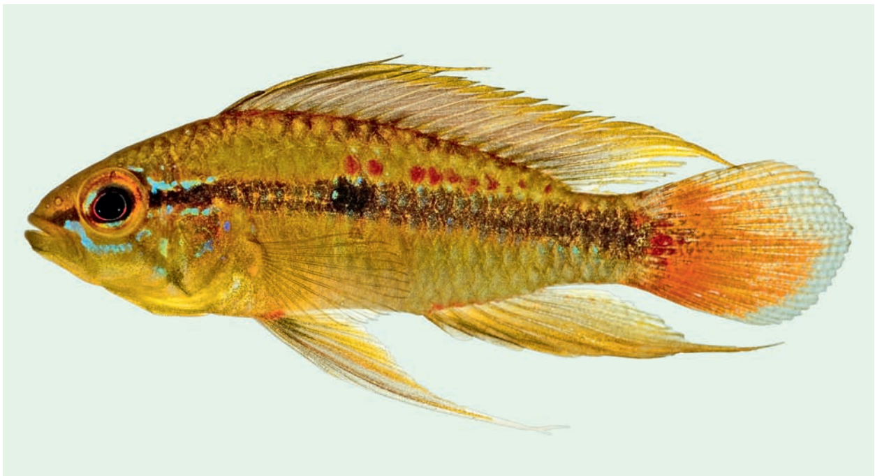
Fig. 2. Live topotypic adult male of the yellow colour morph of Apistogramma erythrura sp. n. immediately after capture in a photographic tank.

mens are summarised in Tab. 1. Description of osteological characters from two dissected paratypes.