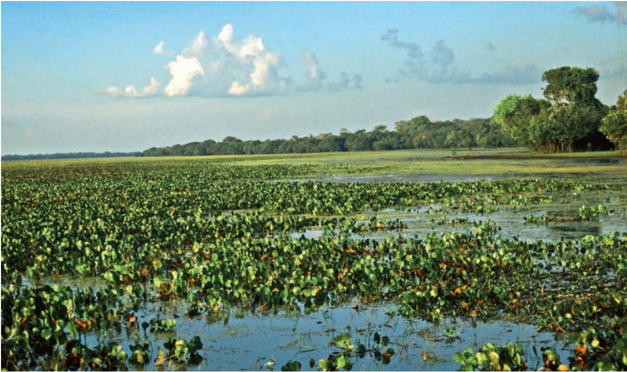
Fig. 7. Collecting sites of Apistogramma erythrura sp. n. in the Laguna Mapawa, drainage of the río Itonamas, approx. 30 km north of Magdalena.

The fish were exclusively collected in dense macrophyte vegetation along the banks of lakes and sometimes small rivulets. Apistogramma erythrura is most abundant in floating meadows where the fish hide inside the dense carpet of large crops of Eichhornia azurea mixed with floating Paspalum repens , Cabomba furcata or Utricularia spp. When scared they jump out of the water and often lie motionless for ten or twenty seconds on the surface of emerged leaves of the vegetation. In a few cases the dwarf cichlids were also found in extremely shallow water in the submerged grass-like terrestrial vegetation extending into the water or in a layer of dead leaves covering the bottom of the bank side.