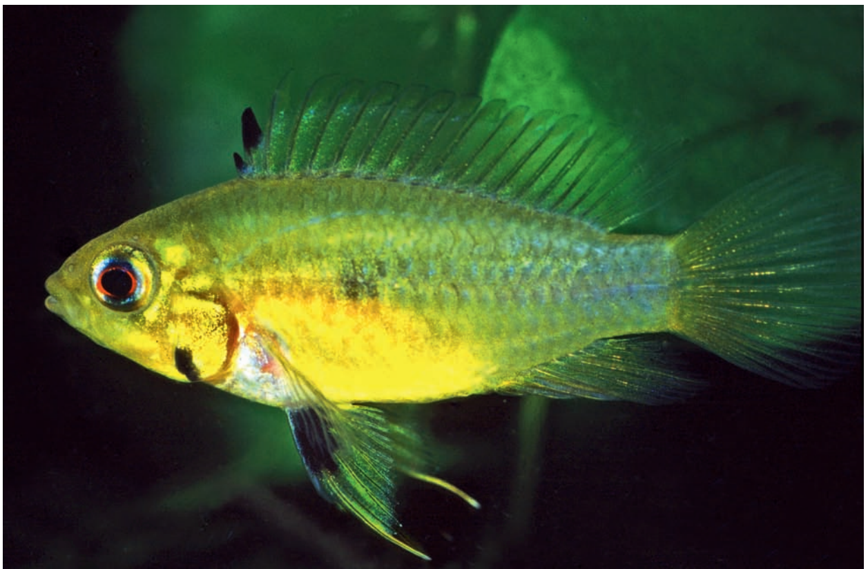
Fig. 6. Adult female of Apistogramma erythrura sp. n. from type locality during brood care in aquarium.

gust or September of different years at the localities above mentioned: pH 5.2–6.4; electrical conductivity <math><10\text{--}20\ \mu\text{S}/\text{cm}</math>; total and temporary hardness <math><1\ \text{°dH}</math>; water temperature 25.1–31.0 °Celsius.