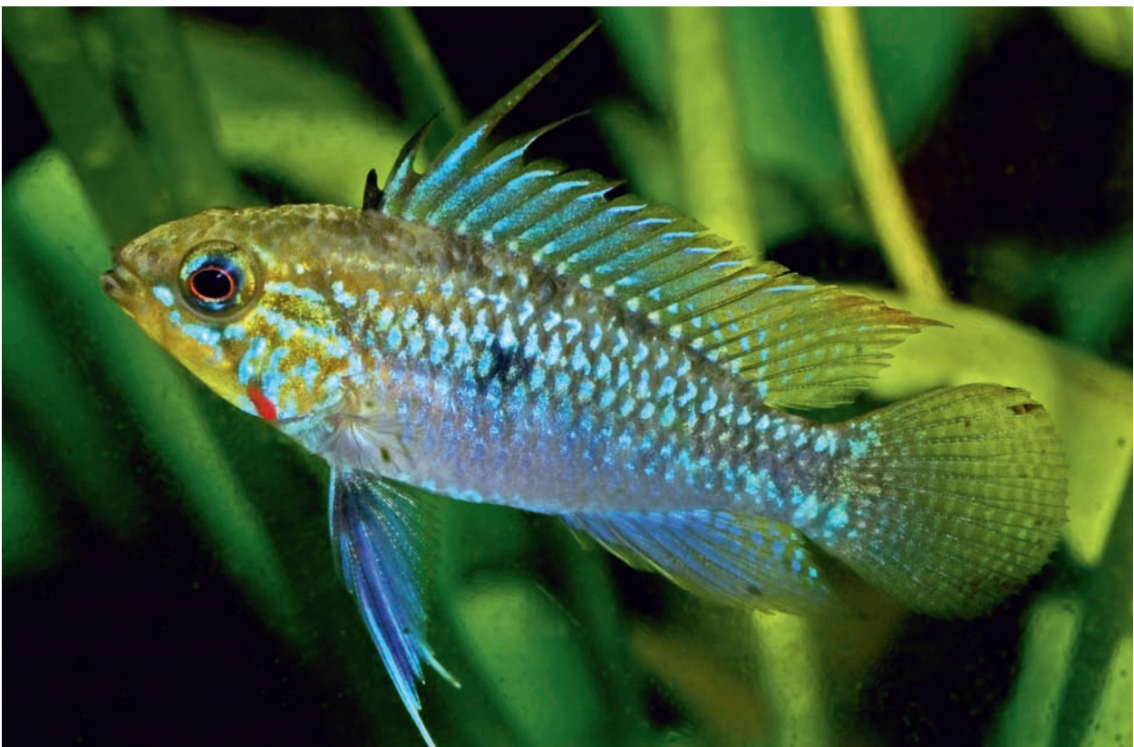
Fig. 4. Adult male of Apistogramma erythrura sp. n. (phenotype HYP; see Tab. 2) from type locality photographed in aquarium.

Ecological notes. All our collecting sites of Apistogramma erythrura are typical clear-water habitats with acid, very soft transparent and colourless water. The following water data were gathered in July, Au-