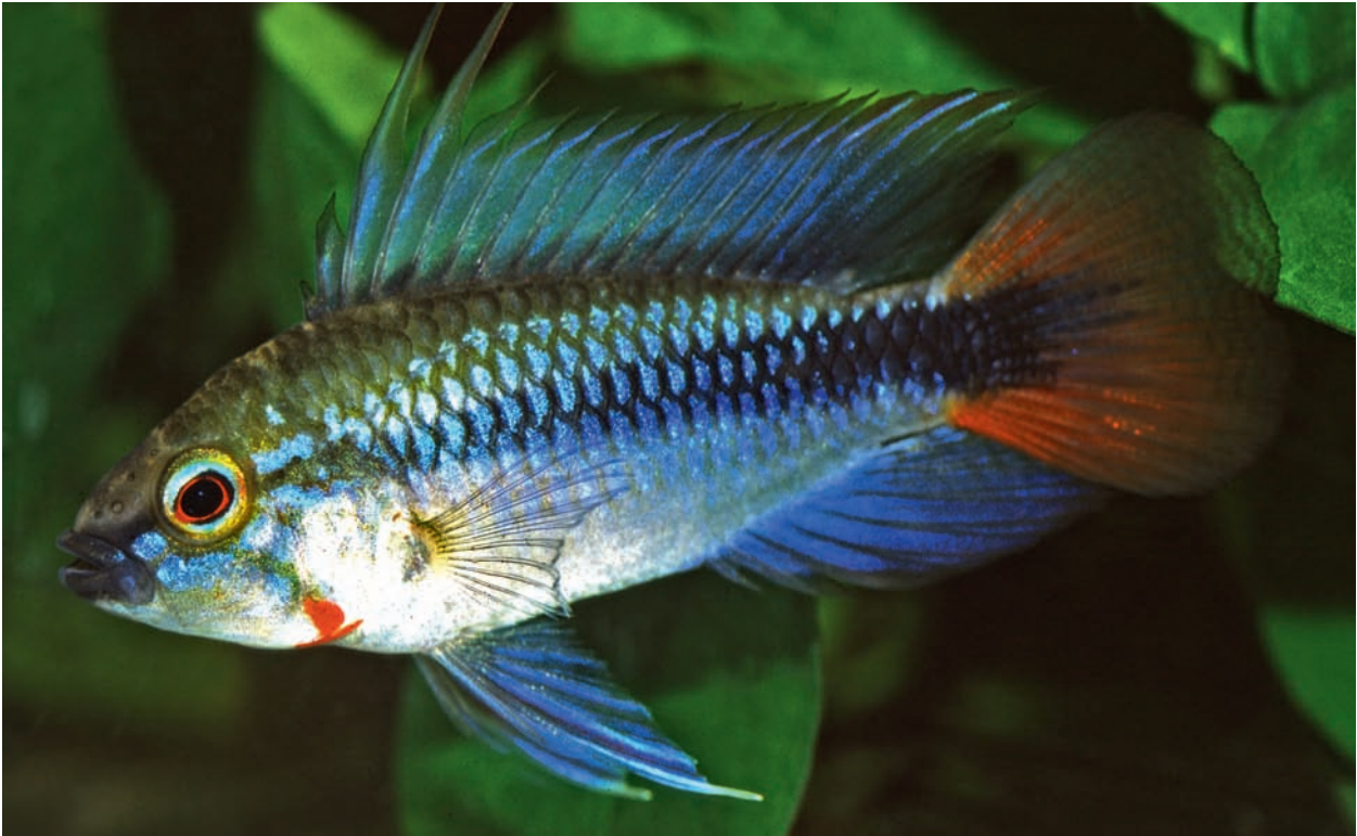
Fig. 3. Adult male of Apistogramma erythrura sp. n. (phenotype RWP; see Tab. 2) from type locality photographed in aquarium.