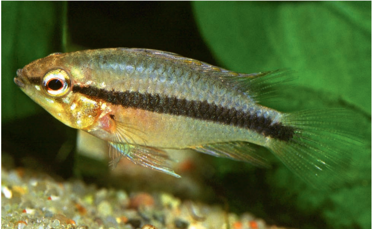
Fig. 5. Adult female of Apistogramma erythrura sp. n. from type locality photographed in aquarium.