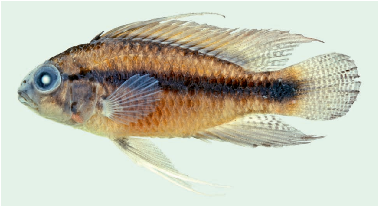
Fig. 1. Male Apistogramma erythrura sp. n., holotype, seven months after fixation, MTD F 31469.