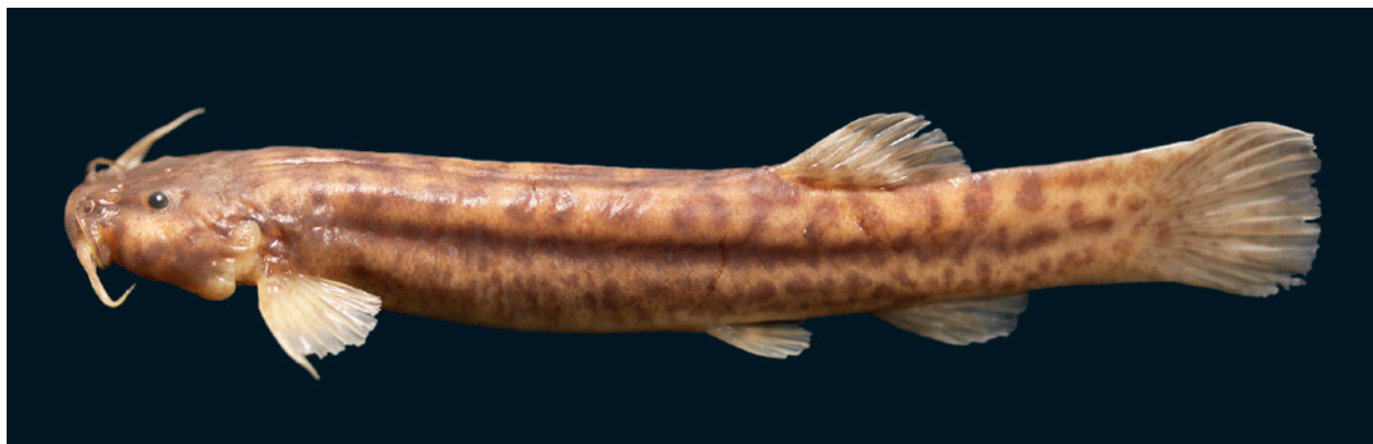
Fig. 3. Trichomycterus gasparinii , UFRJ 8157, preserved holotype, 84.5 mm SL; Brazil: Espírito Santo: Município de Fundão.

tine about equal in length to autopalatine without posterior process. Lacrimal about one fourth supraorbital length; supraorbital rod-shaped. Metapterygoid large, deeper than wide, without distinct processes. Anterodorsal surface of hyomandibula with weak concavity. Urohyal foramen rounded; distal portion of lateral arm of urohyal truncate.