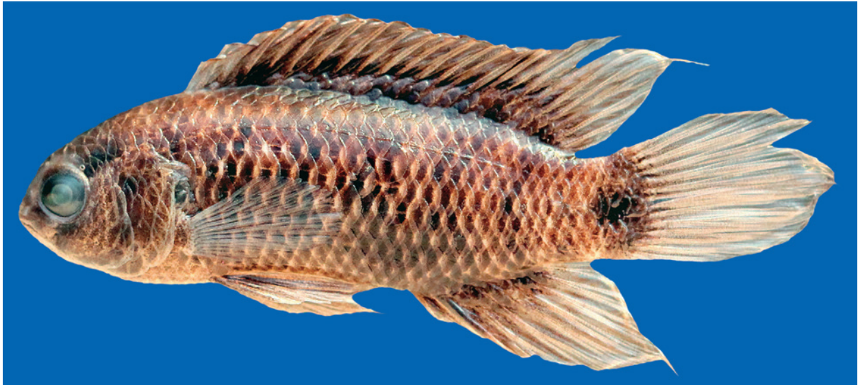
Fig. 1. Badis pancharatnaensis sp. nov., GUMF 0095: 36.7mm SL, holotype.