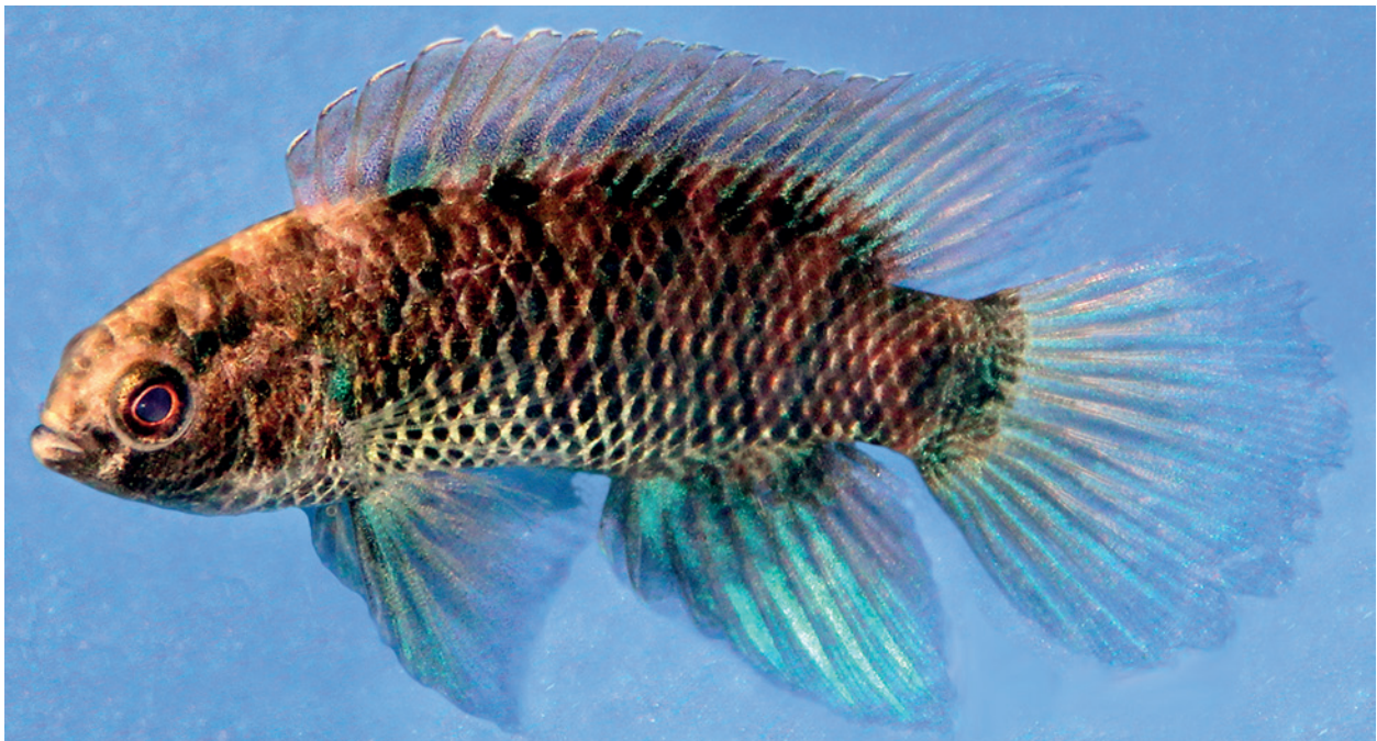
Fig. 2. Colouration in life of Badis pancharatnaensis sp. nov.

vent in both male and female. Caudal-fin rounded. Anal-fin pointed reaching about \frac{1}{3} of caudal-fin length.