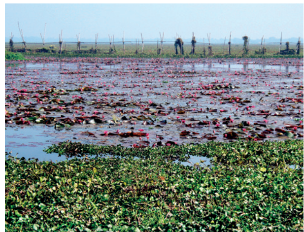
Fig. 5. Hasila Beel, type locality of Badis pancharatnaensis sp. nov. showing habitat.

Etymology. The species is named after the historical place called ‘Pancharatna’ in Goalpara district of Assam, India.