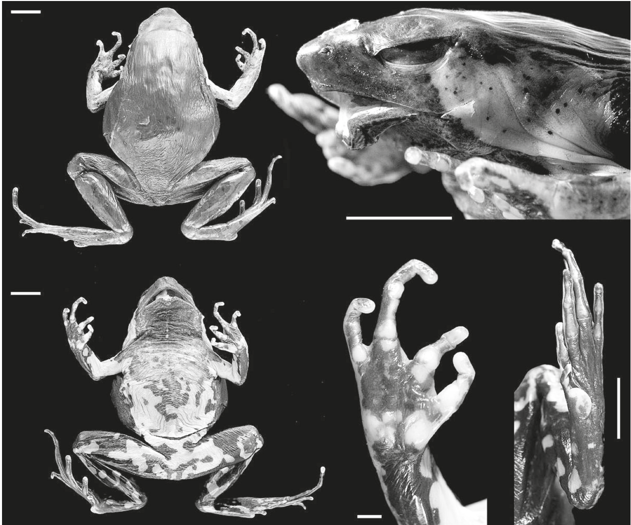
Fig. 3. Preserved paratype (UMMZ 191168) of Scaphiophryne matsoko : dorsal and ventral view, lateral view of head, and ventral views of hand and foot.