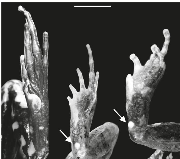
Fig. 4. Ventral views of the tarsus of Scaphiophryne matsoko (left; paratype UMMZ 191168), S. brevis (center; ZFMK 53714) and S. marmorata (right; ZMA 6877), showing the tarsal tubercle (as indicated by arrows) in the latter two species which is absent in S. matsoko .

(see GLAW & VENCES, 2007). Here we only state that upon our own examination of all type specimens, none of these names is available as earlier name for Scaphiophryne matsoko due to the presence of a tarsal tubercle in all of them. Furthermore, the type localities (where known) of these taxa all are in the dry areas of western or north-western Madagascar, thus not agreeing with the distribution range and habitat requirements of S. matsoko .