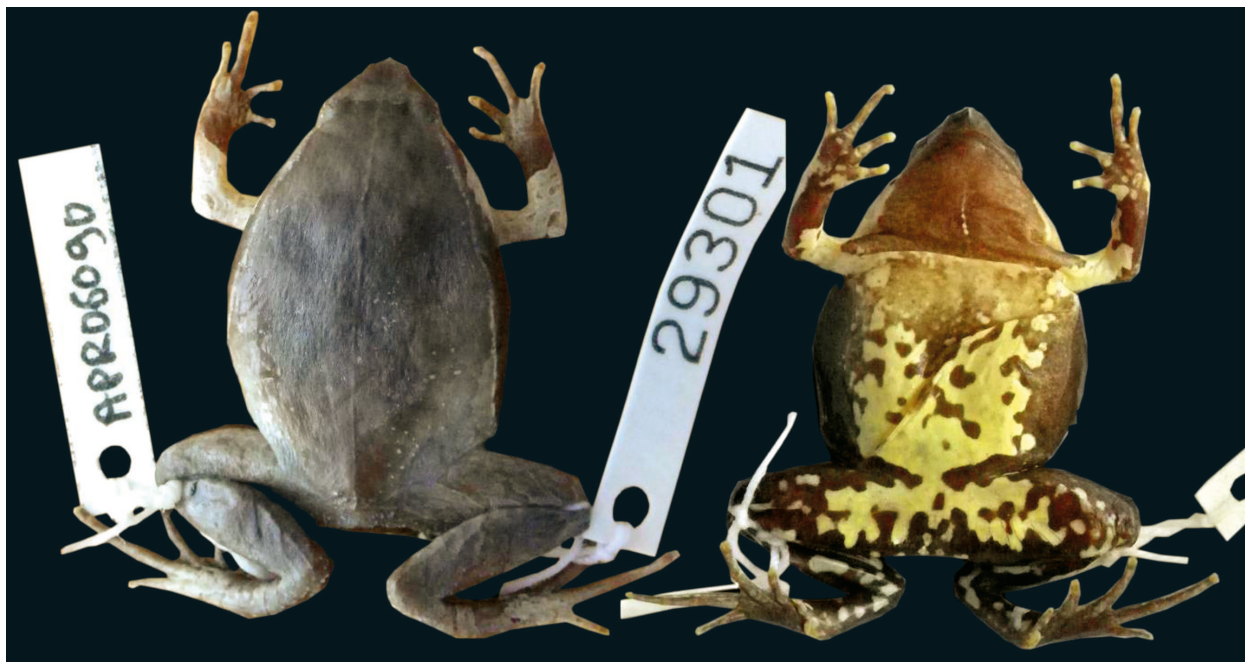
Fig. 2. Preserved holotype of Scaphiophryne matsoko (UADBA 29301) in dorsal and ventral views.

vocal sac. The left side of the head of UMMZ 211519 is damaged so that a number of measurements could not be taken, and additionally transversal and longitudinal ventral cuts were made in this specimen to examine gonads and shoulder girdle. The tibiotarsal articulation reaches the eye. As far as recognizable, also the coloration agrees with that of the holotype (after several years preserved in alcohol): brown ground color, light posterior head sides and tympanic region, distinct brown-white marbling on belly. The two MRSN paratypes are juvenile specimens in mediocre state of preservation, being in ethanol since 15 years. The tibiotarsal articulation of MRSN A2270 reaches the eye. The overall coloration is rather darkened, but it appears substantially similar to the adults, with a blackish mottled belly. MRSN A1849 is comparatively smaller, with a less dehydrated body. The tibiotarsal articulation reaches the eye. In this specimen whitish light spots (in life almost greenish-yellowish) are visible at the level of the fore-arm insertion. The right foot is amputated, with tarsus and metatarsus, but without any visible toe.