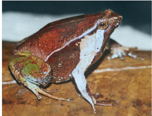
Fig. 1. Living holotype of Scaphiophryne matsoko (UADBA 29301) from Marotondrano in dorsolateral view.

Description of the holotype. Specimen in good state of preservation. For measurements see Table 1. A longitudinal cut along both flanks applied for gonad examination. Body stout; head slightly wider than long, distinctly narrower than body; snout tip pointed in dorsal and lateral views, with a distinct rostral projection beyond mouth opening ca. 2 mm in length. Nostrils directed laterally; slightly protuberant, nearer to tip of snout than to eye; canthus rostralis distinct; loreal region flat; tympanum not clearly visible; supratympanic fold visible, straight; tongue ovoid and broad, posteriorly free and not bifid; maxillary teeth not recognizable; vomerine teeth absent; choanae rounded. Forelimbs slender; subarticular tubercles single and distinct; metacarpal tubercles not recognizable; fingers without webbing; relative length of fingers 1 < 2 < 4 < 3 , fourth finger clearly longer than second finger; finger disks not expanded; nuptial pads absent. Hindlimbs relatively slender and short but longer than in most other Scaphiophryne ; tibiotarsal articulation almost reaches the tympanal region when hindlimb is adpressed along the body; lateral metatarsalia strongly connected; large and sharp inner metatarsal tubercle present, no outer metatarsal tubercle; no tarsal tubercle; traces of webbing between toes; relative length of toes 1 < 2 < 5 < 3 < 4 ;