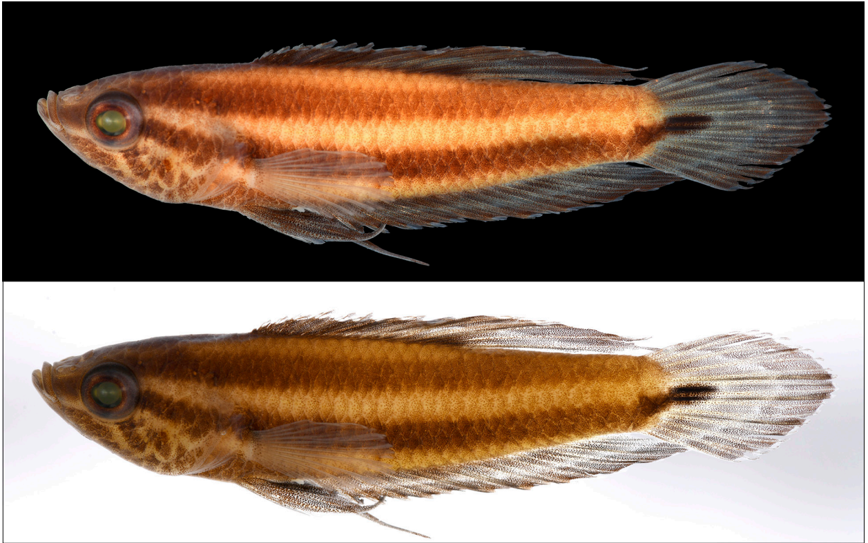
Fig. 1. Parosphromenus barbarae , ZRC 61243, 24.5 mm SL male holotype, photographed on black (top) or white (bottom) background.