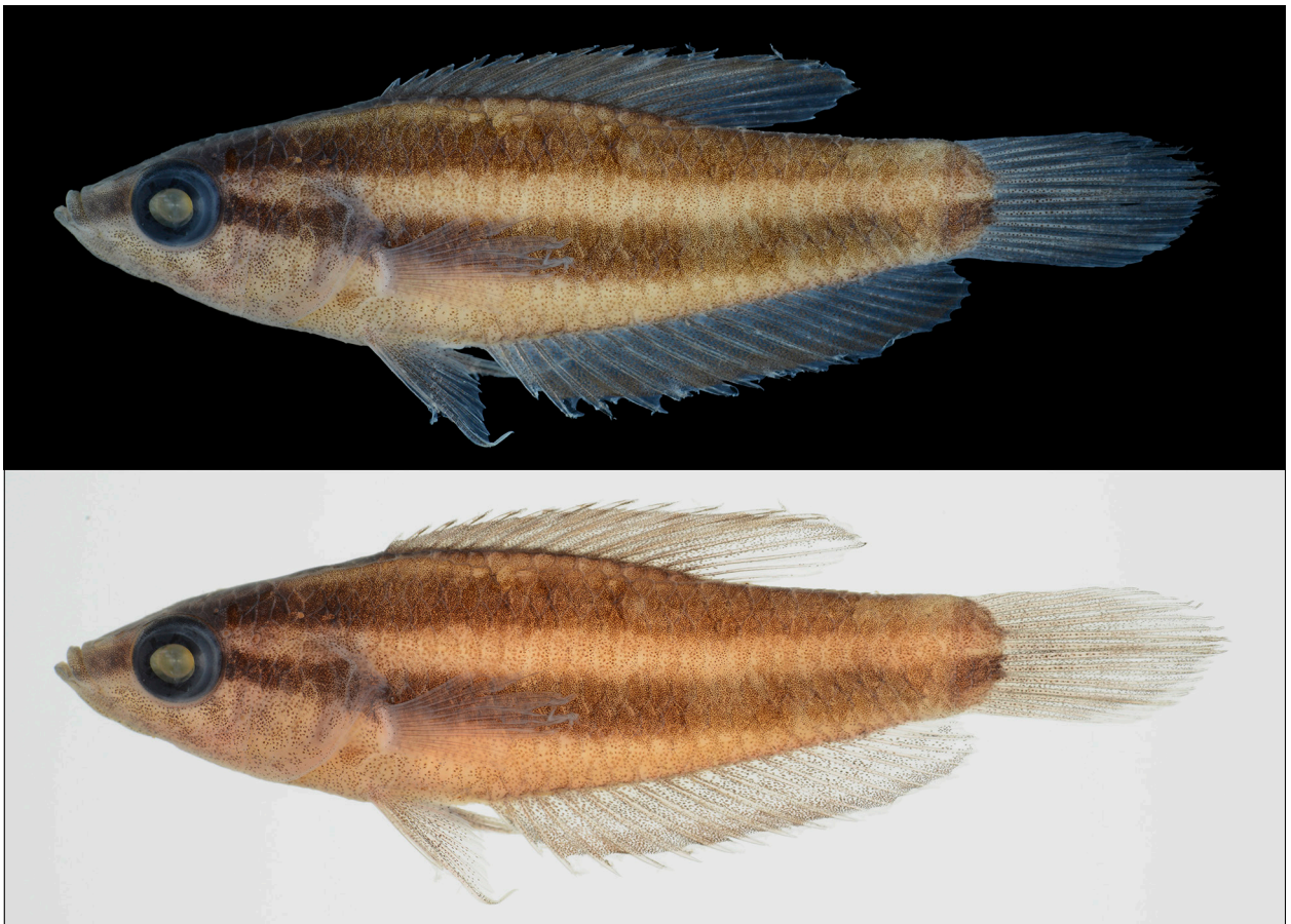
Fig. 2. Parosphromenus barbarae , NMBE 1078329, 24.0 mm SL female paratype, photographed on black (top) or white (bottom) background.