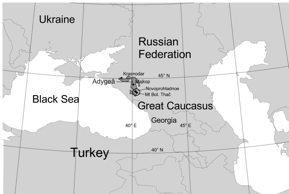
Fig. 1 Location of the study area (circle)

The study area comprises the vicinity of Mt Bol'šoj Thač (44°02'40"N – 40°26'E) in the World Heritage Site »Western Caucasus« (Russian Federation: Republic of Adygea) (Fig. 1).