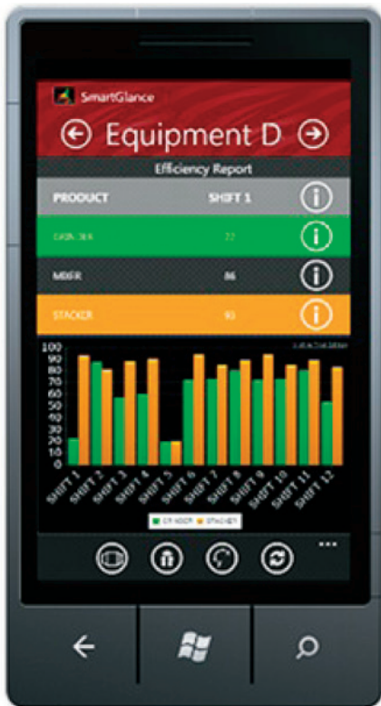
Figure 3: SmartGlance in Action

The InTouch system keeps operators informed on the exact real-time status of the plant and its various departments while management is kept informed on their smart phones via the SmartGlance mobile reporting facility. This real-time information availability allows for the study of cause-and-effect scenarios which were previously invisible to everyone.