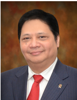
Ir. Airlangga Hartarto, MBA, MMT.

Minister of Industry of the Republic of Indonesia