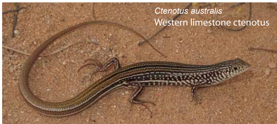
Ctenotus australis Western limestone ctenotus