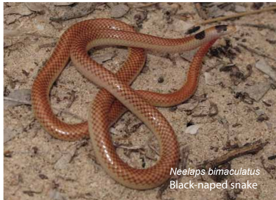
Neelaps bimaculatus Black-naped snake