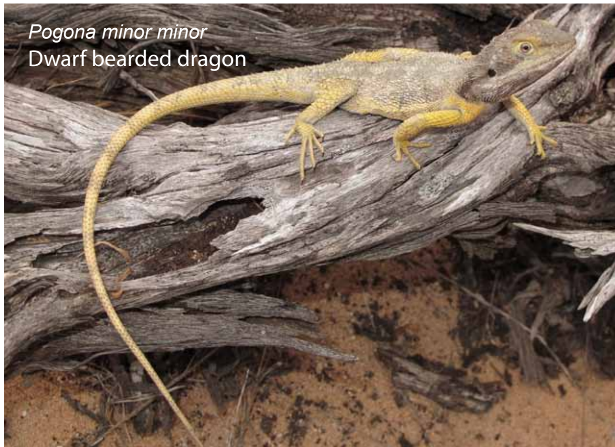
Pogona minor minor Dwarf bearded dragon