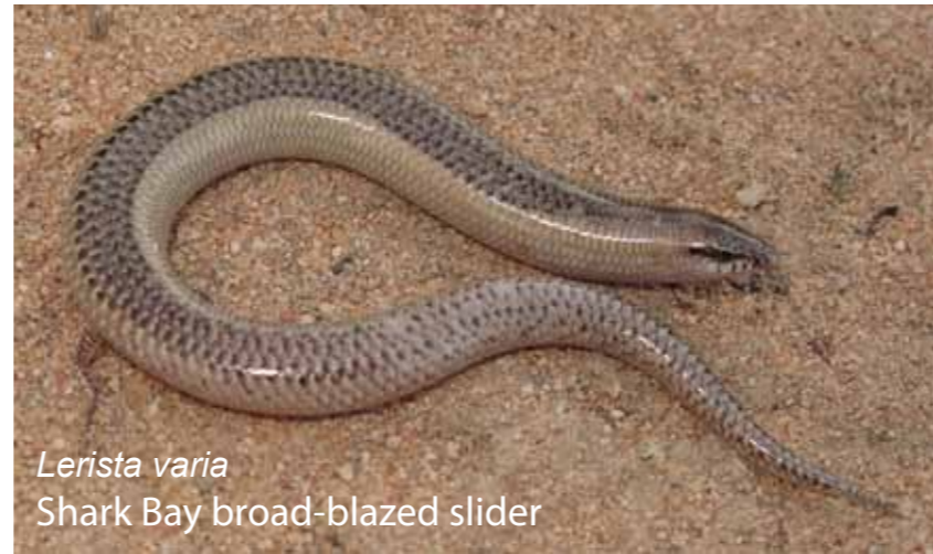
Lerista varia Shark Bay broad-blazed slider