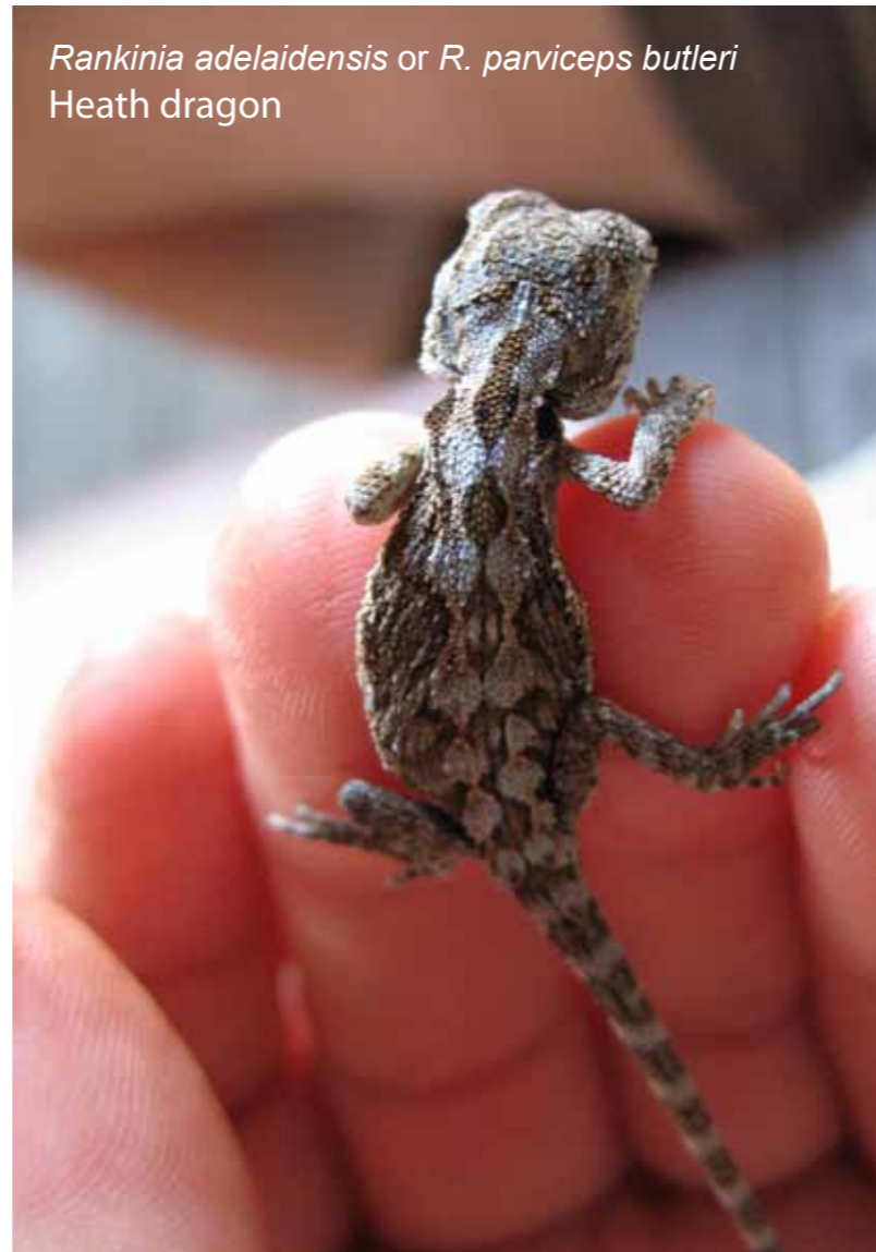
Rankinia adelaidensis or R. parviceps butleri Heath dragon