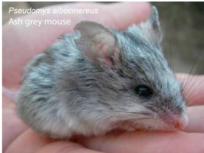
Pseudomys albocinereus Ash grey mouse