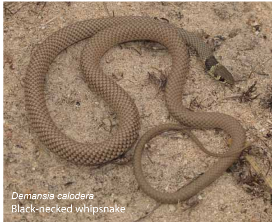
Demansia calodera Black-necked whipsnake