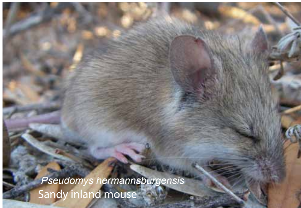
Pseudomys hermannsburgensis Sandy inland mouse