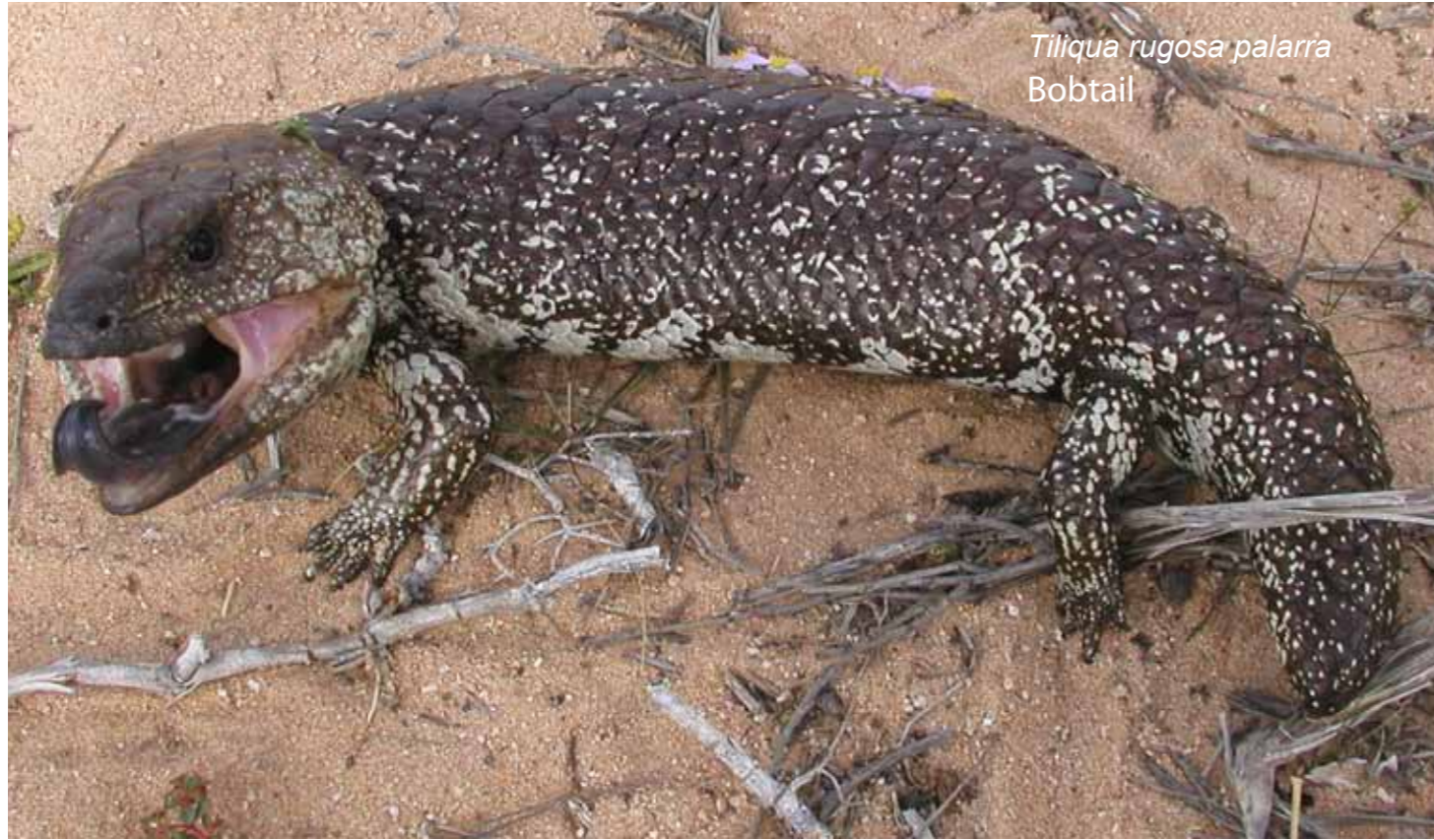
Tiliqua rugosa palarra Bobtail