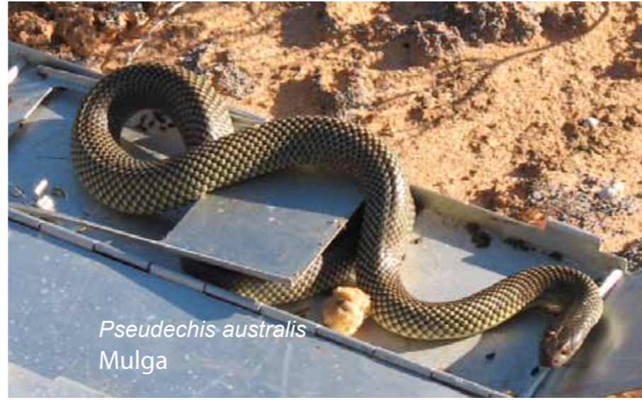
Pseudechis australis Mulga