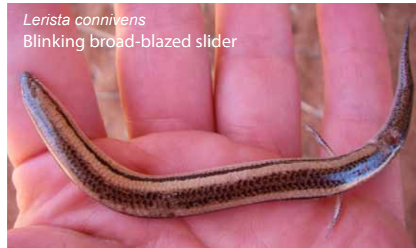
Lerista connivens Blinking broad-blazed slider