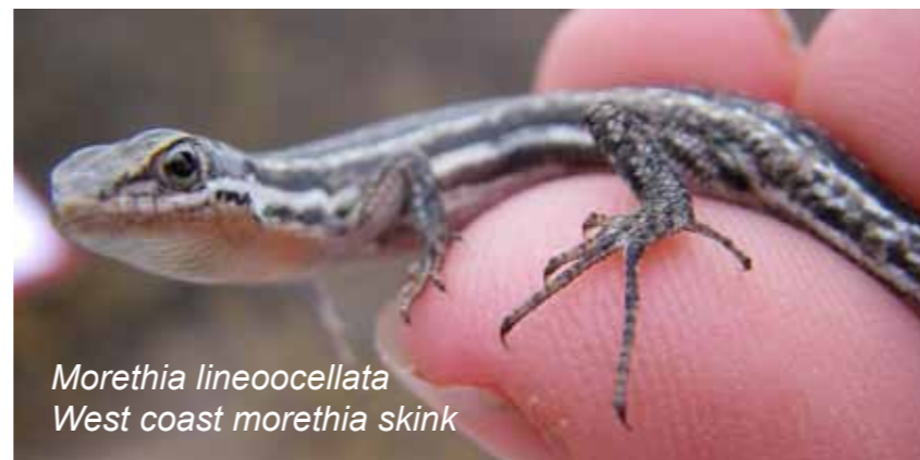
Morethia lineocellata West coast morethia skink