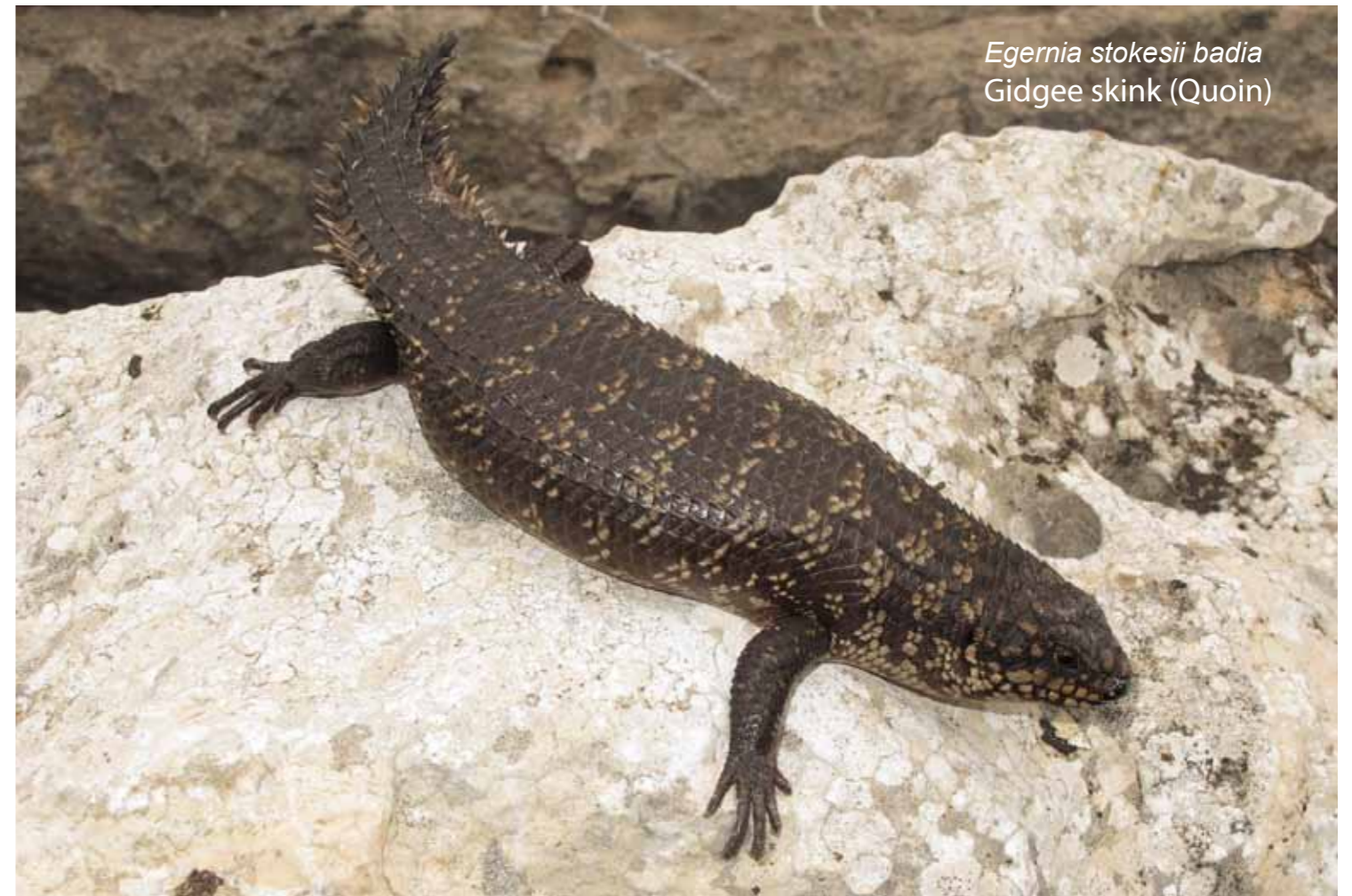
Egernia stokesii badia Gidgee skink (Quoin)