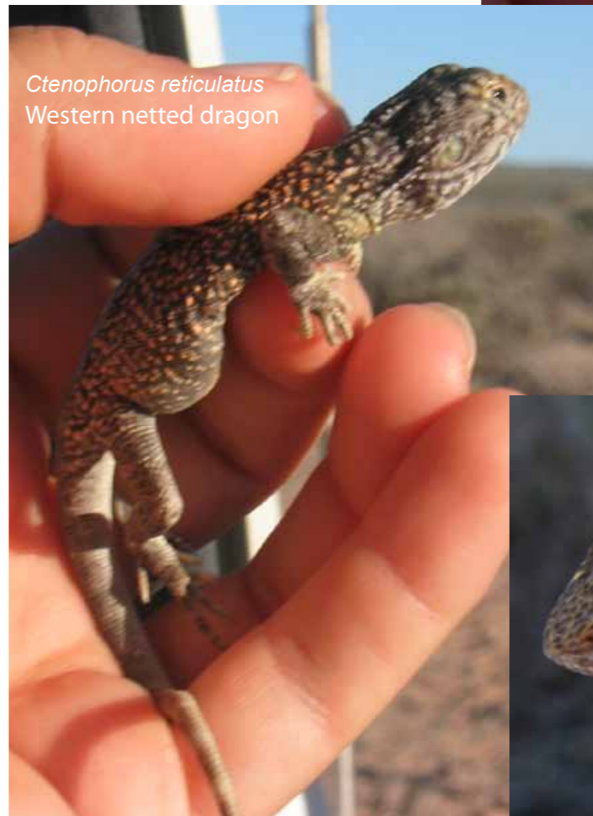
Ctenophorus reticulatus Western netted dragon