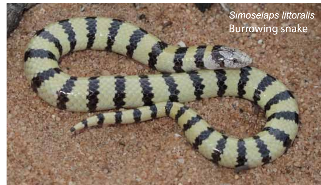
Simoselaps littoralis Burrowing snake