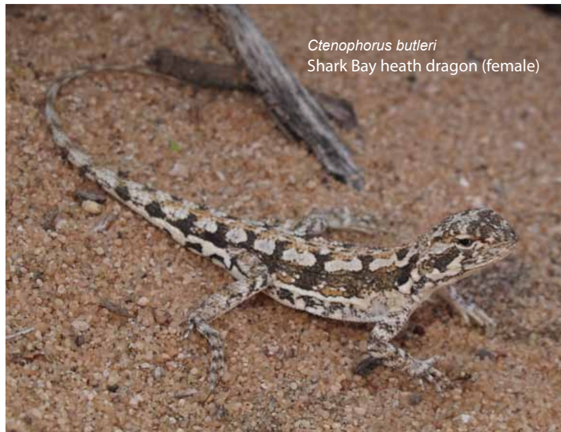
Ctenophorus butleri Shark Bay heath dragon (female)