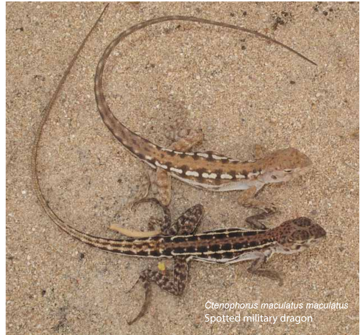
Ctenophorus maculatus maculatus Spotted military dragon