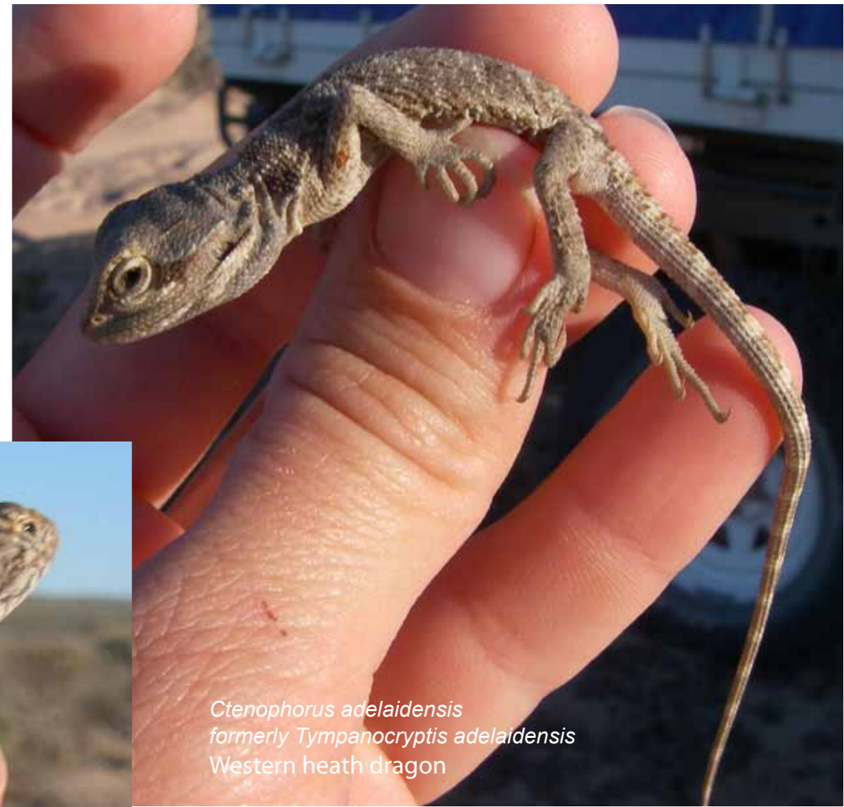
Ctenophorus adelaidensis formerly Tympanocryptis adelaidensis Western heath dragon