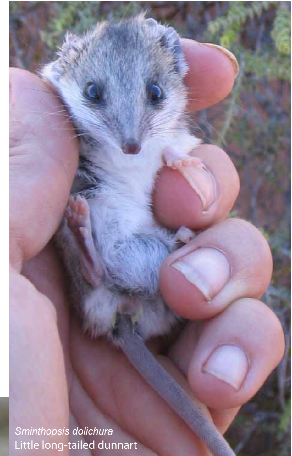
Sminthopsis dolichura Little long-tailed dunnart