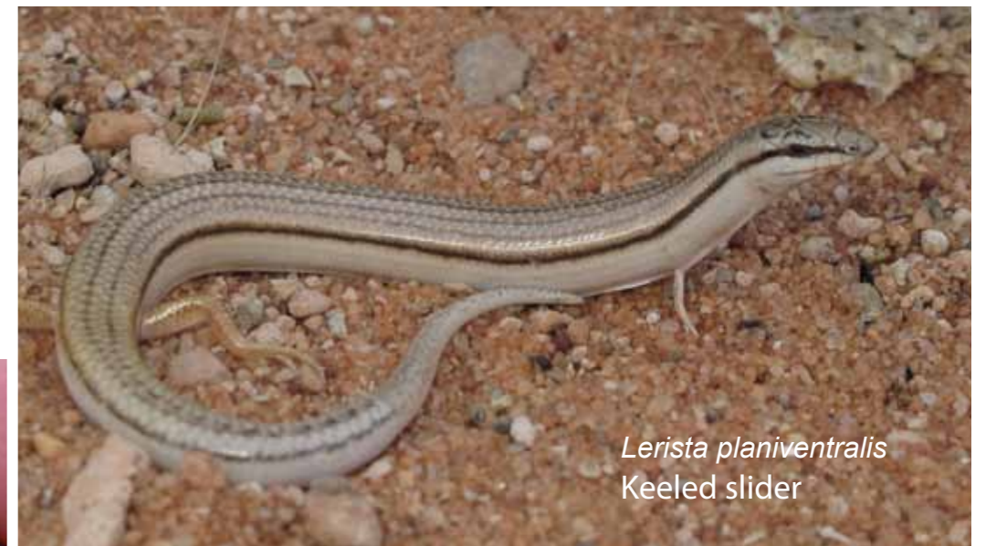
Lerista planiventralis Keeled slider