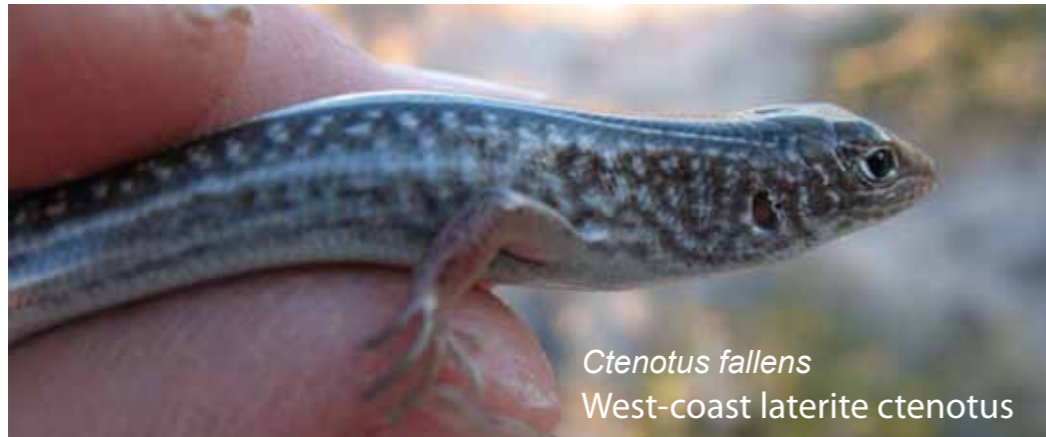
Ctenotus fallens West-coast laterite ctenotus