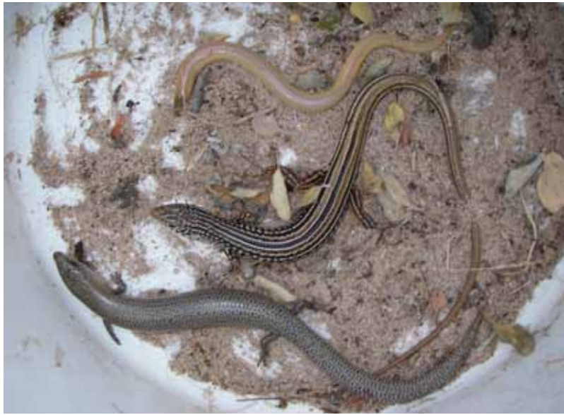
Below - line of pit traps Left - some pit trap contents

This is a snapshot of some of the animals caught in pitfall traps during wildlife surveys on DHI between 2009 and 2014. A few other (non-survey) wildlife images are also included.