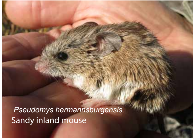
Pseudomys hermannsburgensis Sandy inland mouse