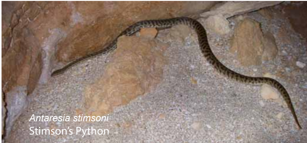
Antaresia stimsoni Stimson's Python