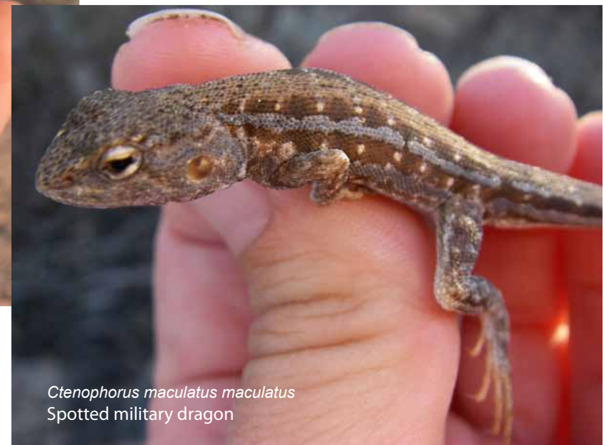
Ctenophorus maculatus maculatus Spotted military dragon