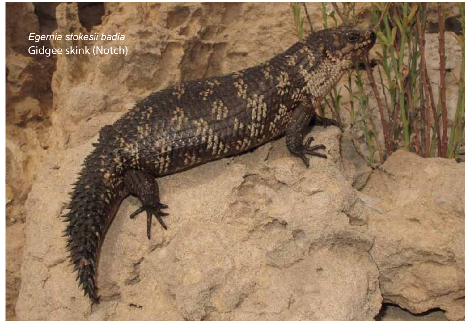
Egernia stokesii badia Gidgee skink (Notch)