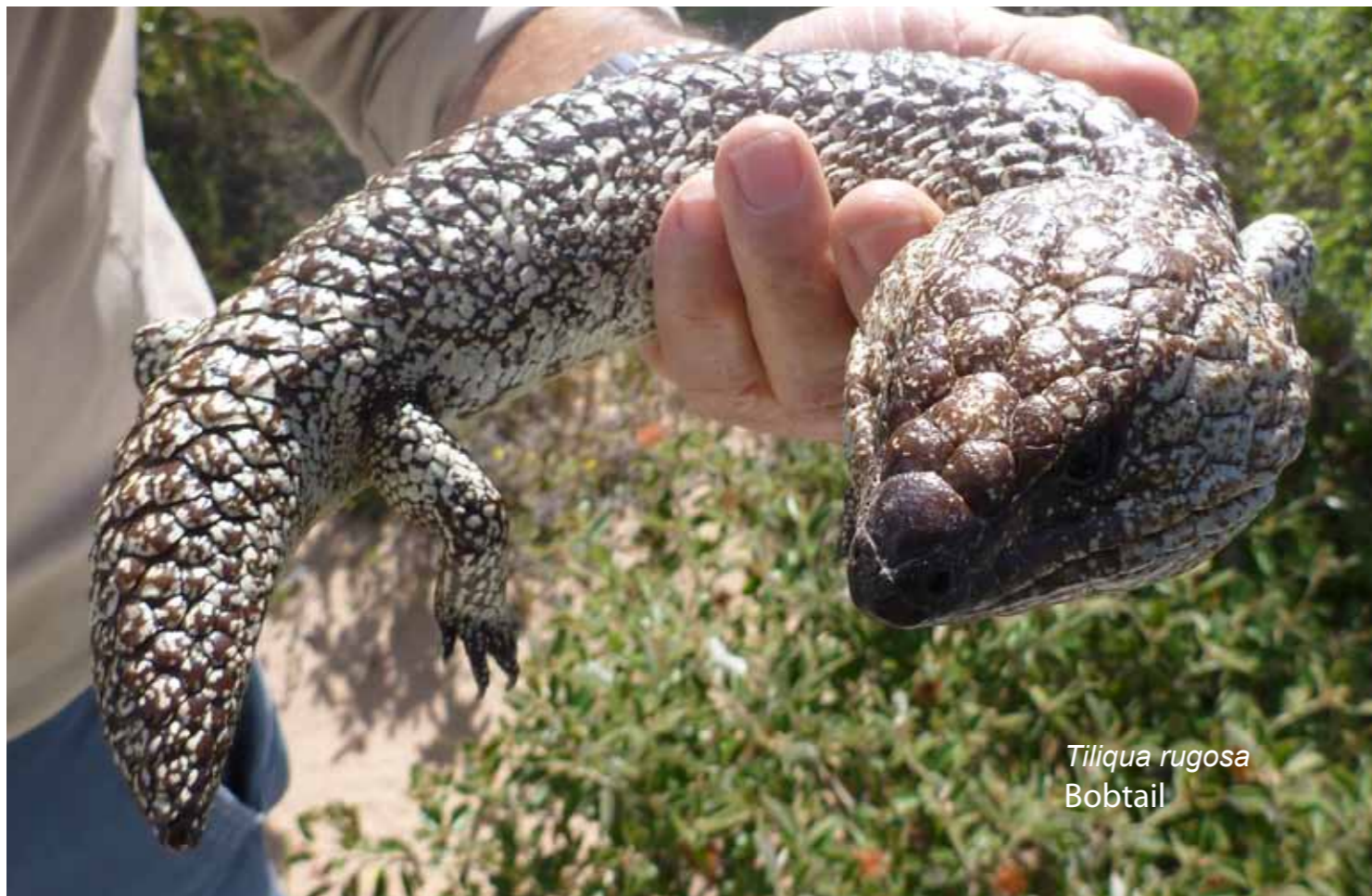
Tiliqua rugosa Bobtail