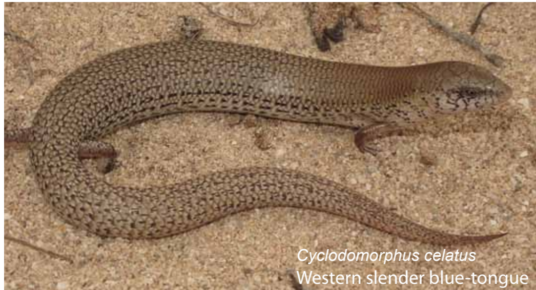
Cyclodomorphus celatus Western slender blue-tongue