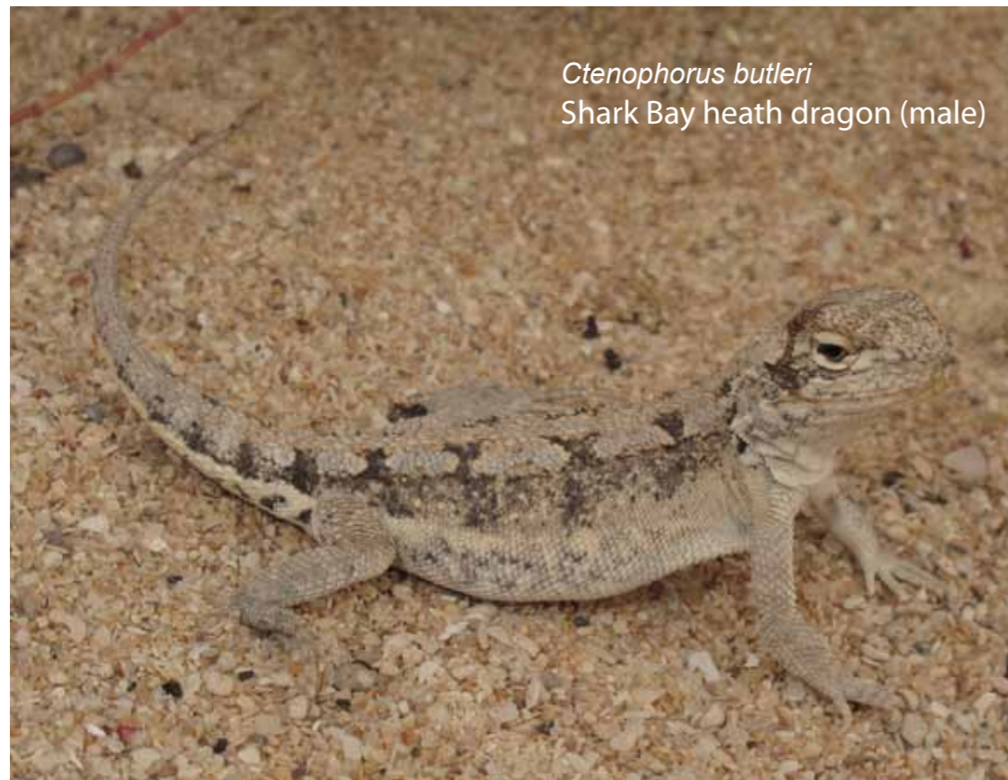
Ctenophorus butleri Shark Bay heath dragon (male)