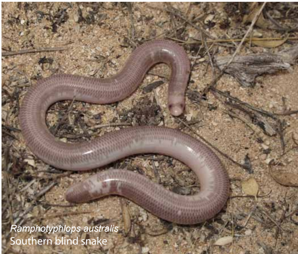
Ramphotyphlops australis Southern blind snake