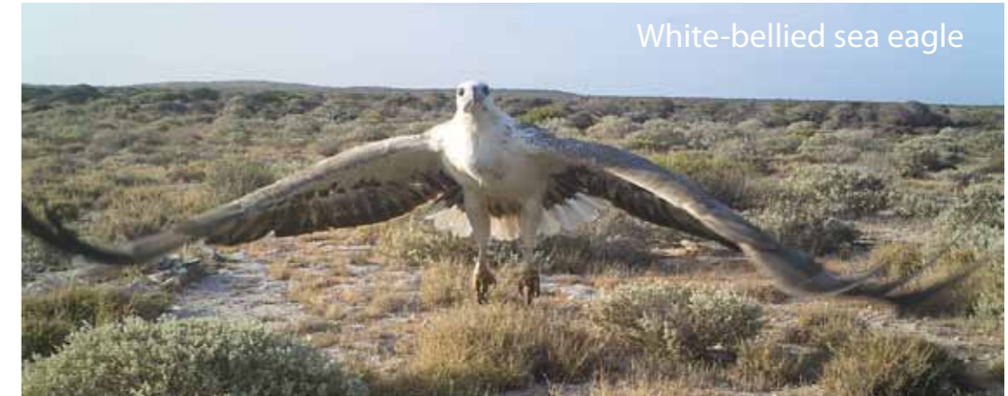
White-bellied sea eagle