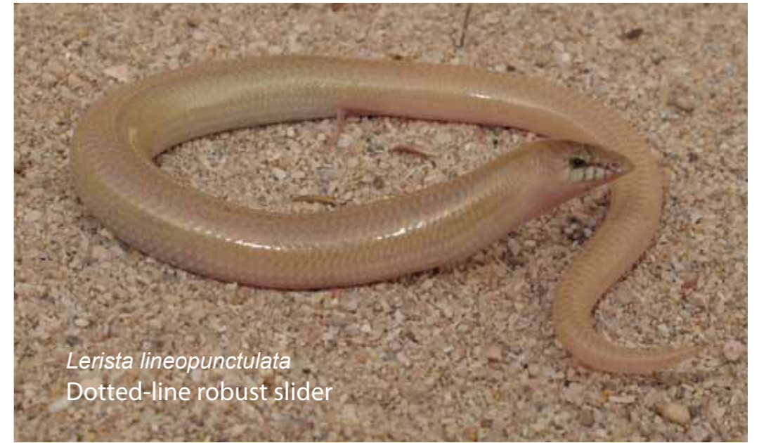
Lerista lineopunctulata Dotted-line robust slider