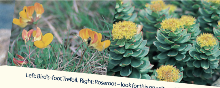
Left: Bird's-foot Trefoil. Right: Roseroot – look for this on salt-enriched cliffs.