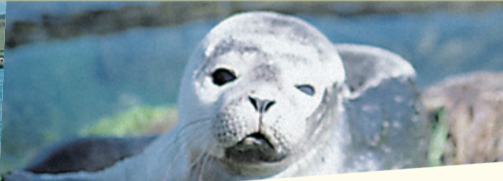
A Common Seal pup