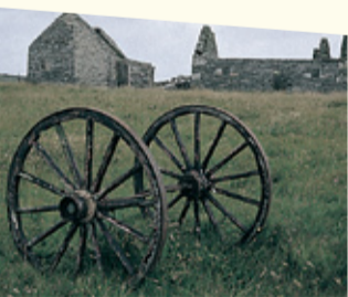
Ruins of 19th c. croft houses