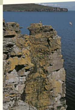
Rugged cliffs of Old Red Sandstone

The Old Red Sandstone rocks that make up most of Bressay and Noss have eroded into a series of rounded hills, the highest of which is the Wart of Bressay at 226m (742 ft). Along parts of the eastern coastline and particularly at the Ord and the Bard there are high seacliffs. Elsewhere the rocky coast is fringed with fertile soils and agricultural land, but much of the interior is heather moorland. The sandstone flags provide ideal building material to which the many skilfully built drystone dykes and croft buildings stand testimony.