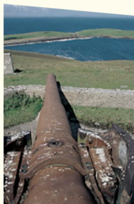
World War 1 gun at Aith Voe

Above Setter a rough track leads towards the headland of Aith Ness, passing the ruins of the old school at Swarthoull and ending at the remote croft of Bruntland. Flooded quarries on Aith Ness are the remains of the 18th and 19th century flagstone industry that provided roofing and paving material for Lerwick. On the top of the hill is an old World War I gun, placed there to protect the approaches to the harbour.