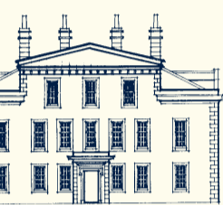
Gardie House - impressive 18th century mansion

Beosetter the upper north road passes through Cruetoun. Just north of here a rough track leads to the uninhabited croft of Globa on the sheltered shores of Aith Voe. Along the valley are numerous planticrubs - circular, drystone structures used to propagate kale plants prior to planting out in the voar (Spring). Used as winter feed for stock, kale plants from Bressay were reputed to be the best and always in demand. Gunnista was the site of the church of St Olaf, the main church on the island until 1722. The present churchyard contains the remains of an 18th century mausoleum built by the Henderson family.