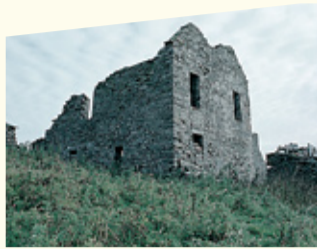
The Old Haa of Cruester

Taking the lower north road to Heogan, you will travel past the impressive building of Gardie House with its walled garden. Built in 1724, this is one of the principal laird's houses in Shetland and home to the present Lord