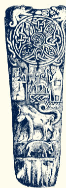
The Bressay Stone

From the Uphouse junction a road leads down to Setter with a rough rutted track continuing to the Voe of Cullingsbrough. A pleasant walk along the shore leads past the old settlement site to a walled churchyard. Within the enclosure are the ruins of the 10th century pre-Reformation chapel of St Mary's. There is also an interpretive board and replica of the Bressay Stone - an engraved Pictish stone which was discovered nearby in 1864. At the north-west corner, the churchyard wall intersects the remains of another broch.