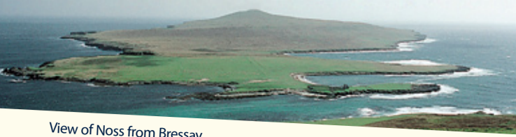
View of Noss from Bressay