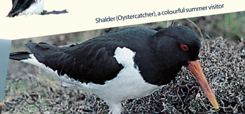
Shalder (Oystercatcher), a colourful summer visitor