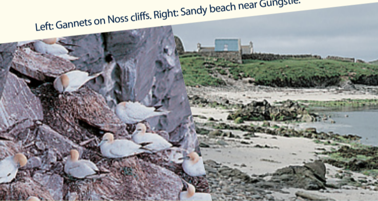
Left: Gannets on Noss cliffs. Right: Sandy beach near Gungstie.

A walk around the perimeter of the island will take at least three hours. The sandstone cliffs on the east side of the island have weathered into innumerable parallel ledges and crevices providing ideal nest sites for over 8000 pairs of Gannets, 45 000 pairs of Guillemots and smaller numbers of Kittiwake, Shag, Puffin and Razorbill. The moorland interior supports about 400 pairs of Bonxies (Great Skuas) and a few pairs of Arctic Skua.