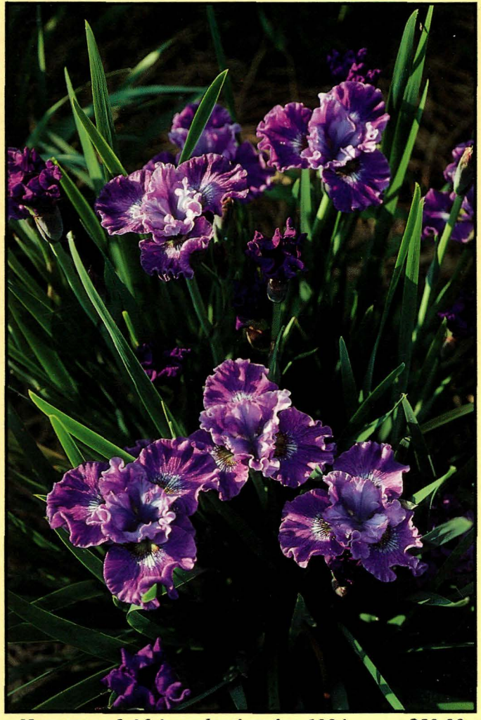
New tetraploid introduction for 1994 $50.00 Another quality offspring from Jewelled Crown.

Also for 1994: SIMPLE GIFTS, $35.00 a tailored, very pale lavender-blue diploid liked by many at the 1993 Siberian Convention.