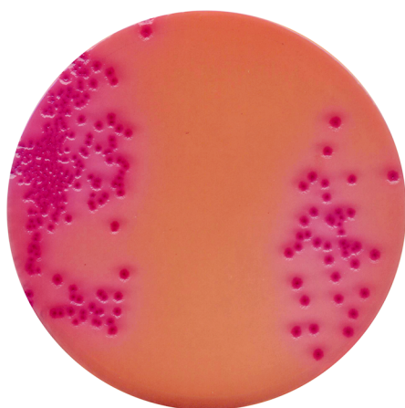
Yersinia enterocolitica ATCC 35669-4-60