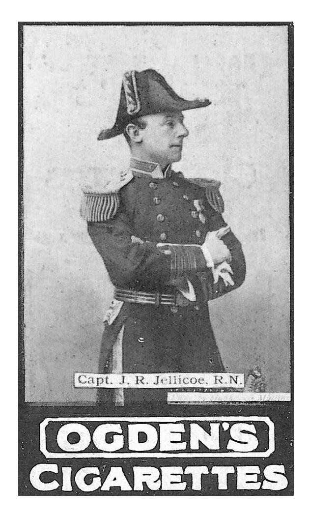
Jellicoe as Captain, in command of HMS Centurion, flagship on the China Station (his depiction on a contemporary cigarette card shows he was in the public eye long before becoming an admiral).

Camp to the King on 8 March 1906.<sup>[12]</sup> Promoted to rear admiral on 8 February 1907,<sup>[13]</sup> he pushed hard for funds to modernise the navy, supporting the construction of new Dreadnought -type battleships and Invincible -class battlecruisers.<sup>[14]</sup> He supported F. C. Dreyer's improvements in gunnery fire-control systems, and favoured the adoption of Dreyer's "Fire Control Table", a form of mechanical computer for calculating firing solutions for warships.<sup>[15]</sup> Jellicoe arranged for the output of naval ordnance to be transferred from the War Office to the Admiralty.<sup>[16]</sup>