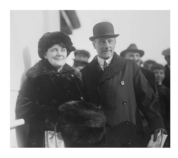
Lord and Lady Jellicoe, 1924

Jellicoe was promoted to Admiral of the Fleet on 3 April 1919.<sup>[39]</sup> He became Governor-General of New Zealand in September 1920<sup>[40]</sup> and while out there also served as Grand Master of New Zealand's Masonic Grand Lodge.<sup>[41]</sup> Following his return to England, he was created Earl Jellicoe and Viscount Brocas of Southampton in the County of Southampton on 1 July 1925.<sup>[42]</sup> He died