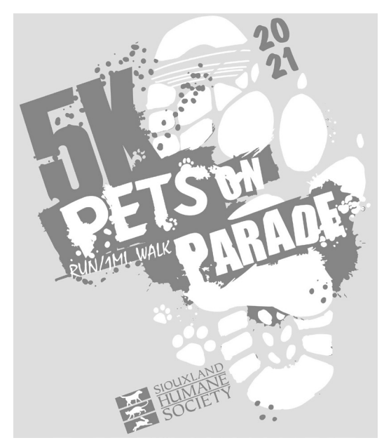
See Page 1 for Details