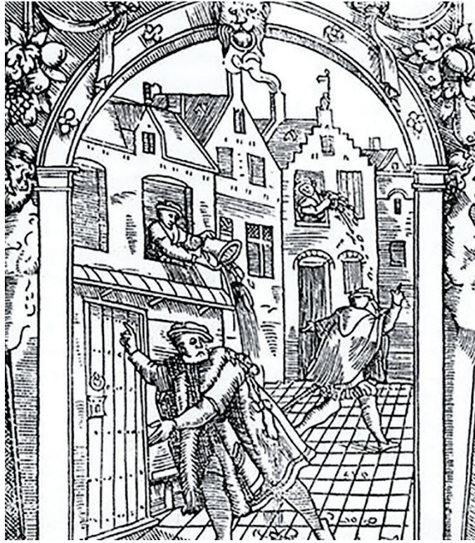
Figure 1. Medieval Times . Origin unknown

is normally hidden and not spoken about. The second is that telling a joke is a context-bound act of social communication. Scatological humour is usually regarded as the domain of children but – as I will argue in the conclusion – it is also a phenomenon that connects children with the older generation. The next section provides examples of scatological humour from various parts of the world and from children as well as adults. It illustrates the different shades of this type of humour depending on the specific context in which it is produced and exchanged.