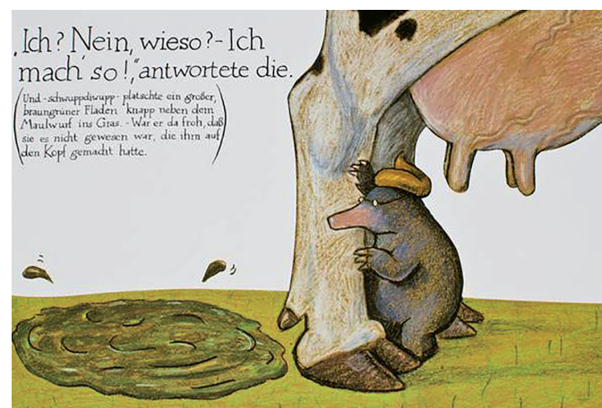
Figure 3: The little mole visiting the cow and watching its pat.

The anthropological and sociological literature on children's faecal humour may be scarce but concrete examples of children's enjoyment with poop stories abound. The absolute favourite is the story ' Vom kleinen Maulwurf, der wissen wollte, wer ihm auf den Kopf gemacht hat ' (About the little mole who got pooped on his head) (Holzwarth and Erlbruch 1989). I assume that nearly everyone with a child owns a copy of the booklet and has read the story several times to their child while pointing at the pictures of different animals with different shapes of poop falling to the ground. The little mole wants to find out who dropped a turd on his head. He goes from animal to animal but each proves not to be the one by demonstrating his type of poop. Finally two flies, as shit experts, tell the little mole that the turd came from the butcher's dog. The little mole takes his revenge and deposes a tiny little turd on the head of the dog and happily disappears underground. The dog does not even seem to notice his action.