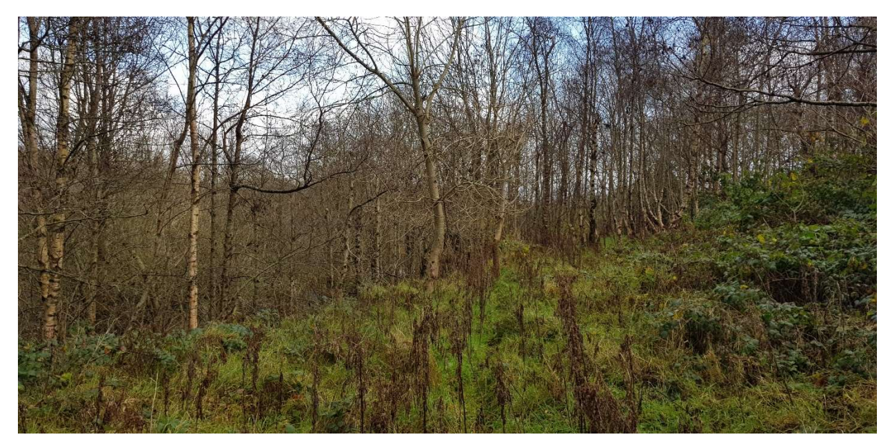
Plate 12-11 View of area 5 looking east.