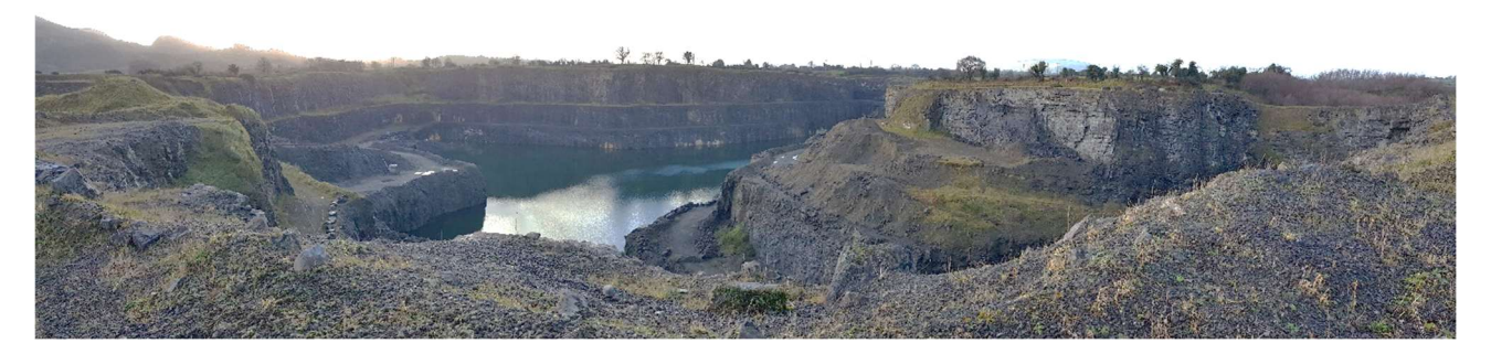
Plate 12-7 Area 1 Panoramic view of the existing extraction area looking west.