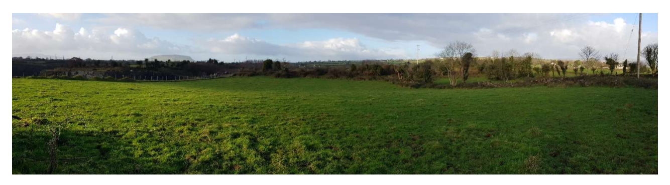
Plate 12-5 View from RMP SL020-093--- Ringfort – cashel looking north-west.