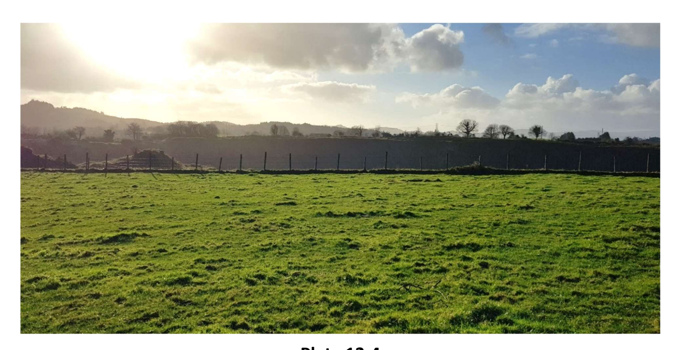
Plate 12-4 View from RMP SL020-093--- Ringfort – cashel looking south-west to the quarry.