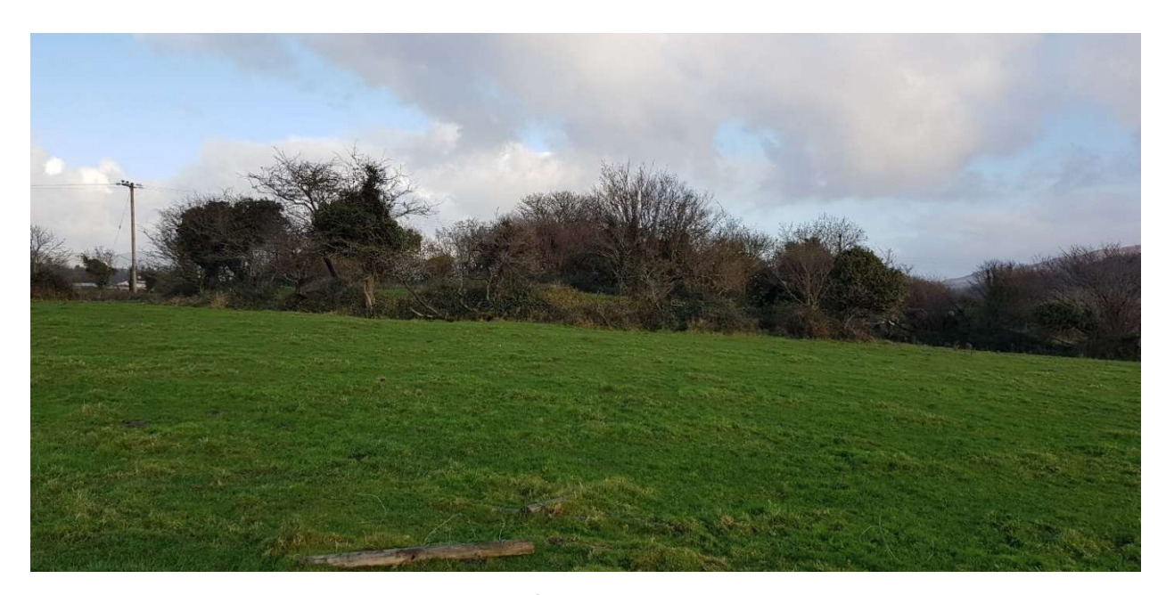
Plate 12-3 View of RMP SL020-093--- Ringfort – cashel looking north-east.