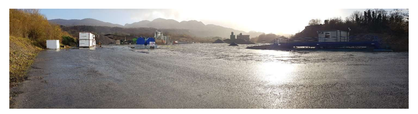
Plate 12-12 Panoramic view of area 6 looking south.