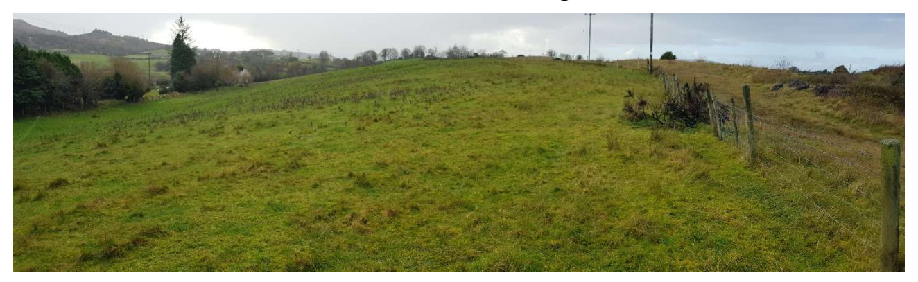
Plate 12-9 View of area 3 looking south-west.