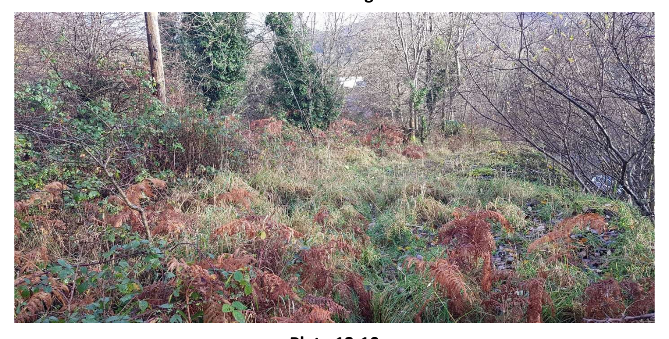
Plate 12-10 View of area 4 looking south-west.