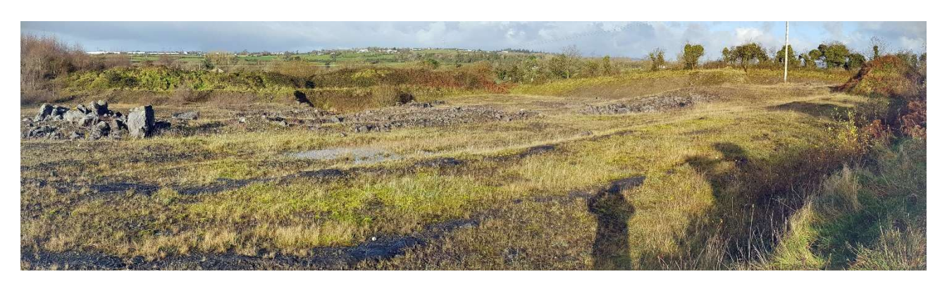
Plate 12-8 Panoramic view of area 2 looking north-west.