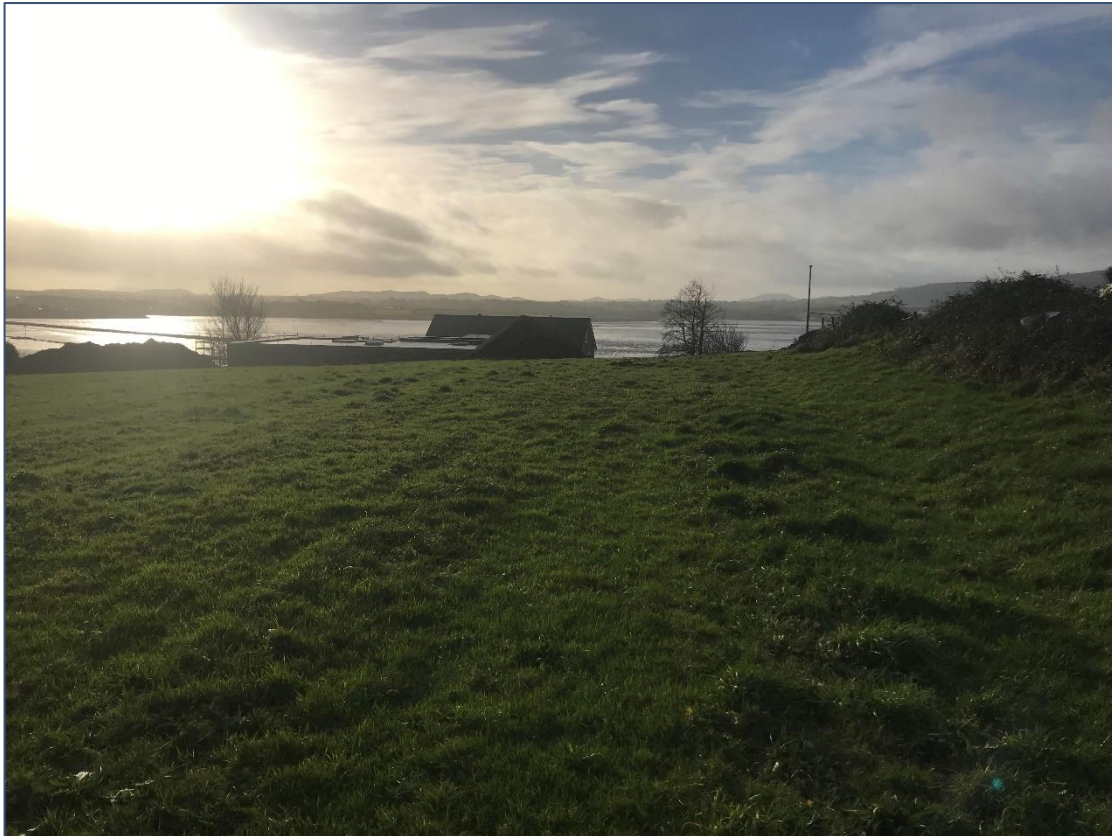
Plate 2-2 Site of proposed development, facing south towards the estuary