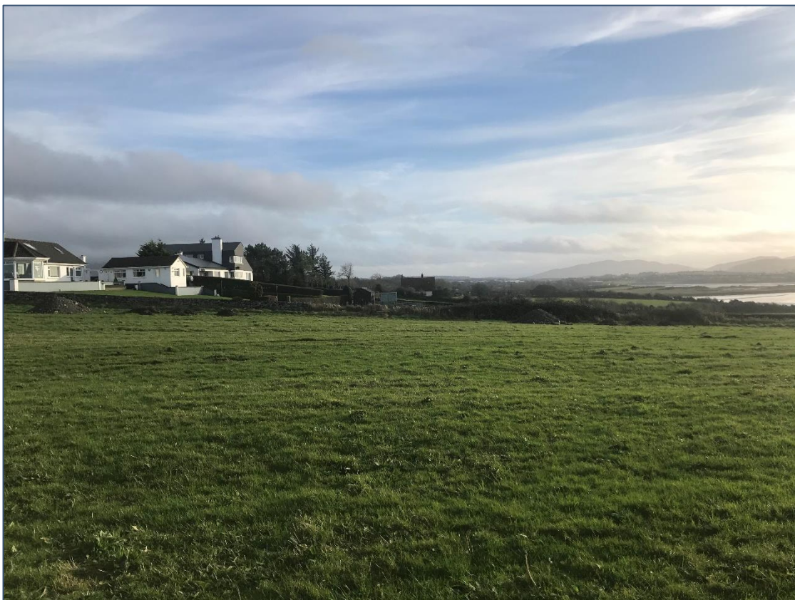
Plate 2-1 Site of proposed development, facing north east

The site was a field of Improved Agricultural Grassland (GA1) (Plates 2-1 & 2-2). Species recorded in the Improved Agricultural Grassland (GS2) habitat include Yorkshire fog ( Holcus lanatus ), perennial rye grass ( Lolium perenne ), ribwort plantain ( Plantago lanceolata ) and creeping buttercup ( Ranunculus repens ). The western field boundary was marked by fencing and bramble scrub (WS1) and the eastern boundary consisted of a similar boundary, but with a stone wall adjacent to a residential house located to the north east. There are existing residential properties to the north east, west and to the south. The site is separated from the SAC to the south by a distance of over 90 metres but is separated from it by existing residential dwellings and a site, which is currently under construction. No surface watercourses were recorded on the site.