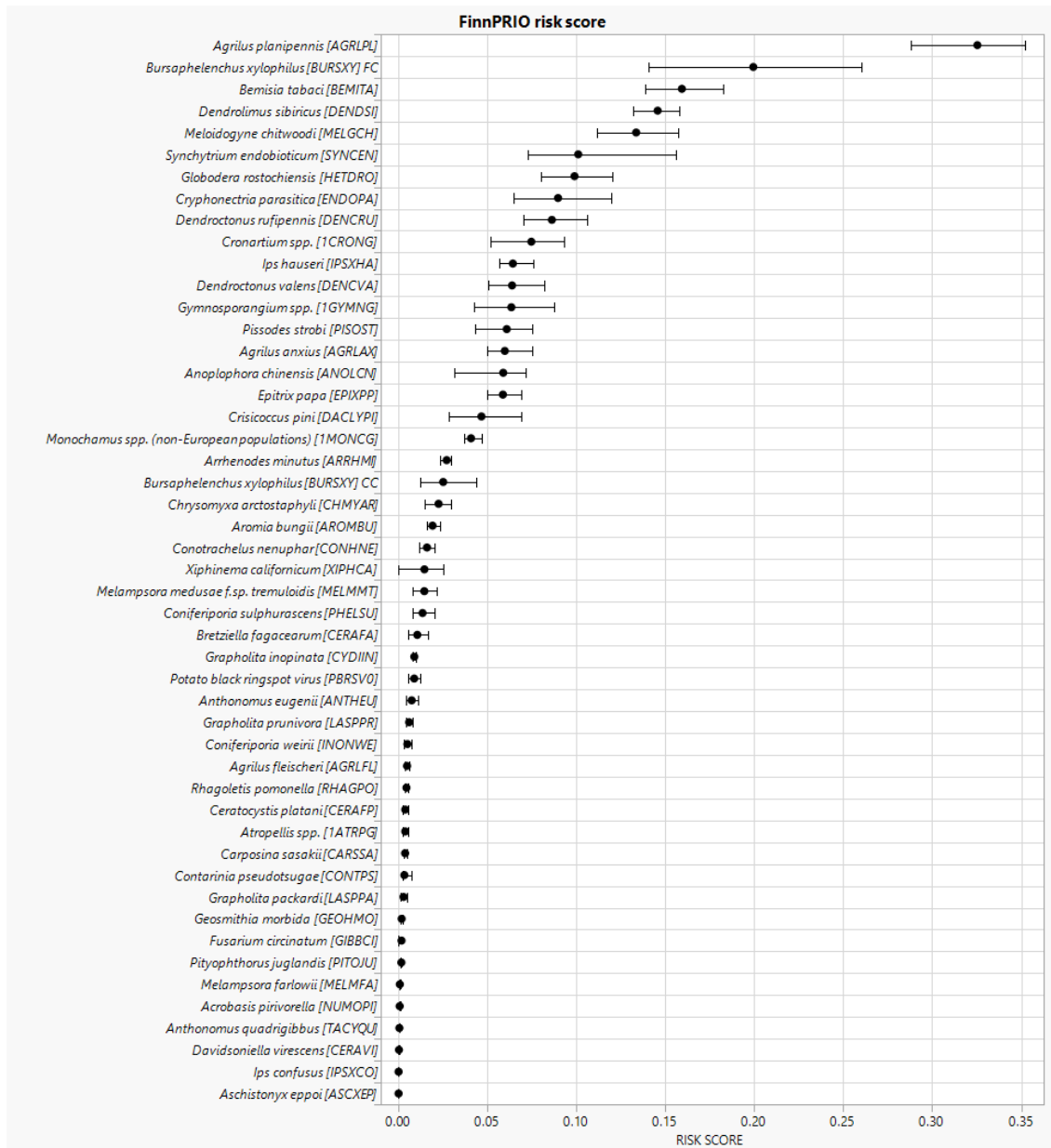
Figure 2. FimmPRIO risk score for the assessed pests (i.e. Entry score × Establishment & Spread score × Impact score). For B. xylophilus , “FC” stands for future climate whereas “CC” stands for current climate. Note that the scores for preventability and controllability are not included in the risk score (scores of these factors are provided in Figure 3). The dots represent the mean values and the whiskers represents the 5th and 95th percentiles of the probability distributions and the assessed pests are here sorted according to the mean values.