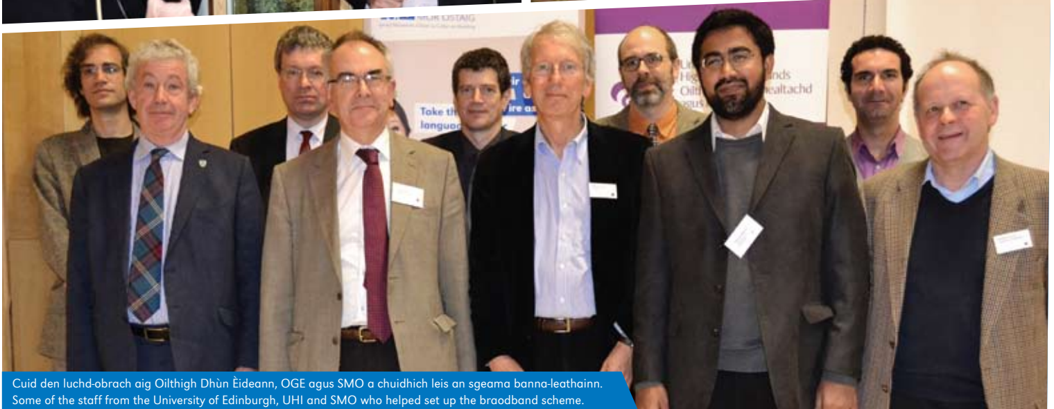
Cuid den luchd-obrach aig Oilthigh Dhùn Èideann, OGE agus SMO a chuidich leis an sgeama banna-leathainn. Some of the staff from the University of Edinburgh, UHI and SMO who helped set up the broadband scheme.

Mas ann air post-d a b' fheàrr leibh a' chuairt-litir fhaighinn cuiribh fios gu litir@smo.uhi.ac.uk If you would prefer to receive an electronic copy of the newsletter please email litir@smo.uhi.ac.uk