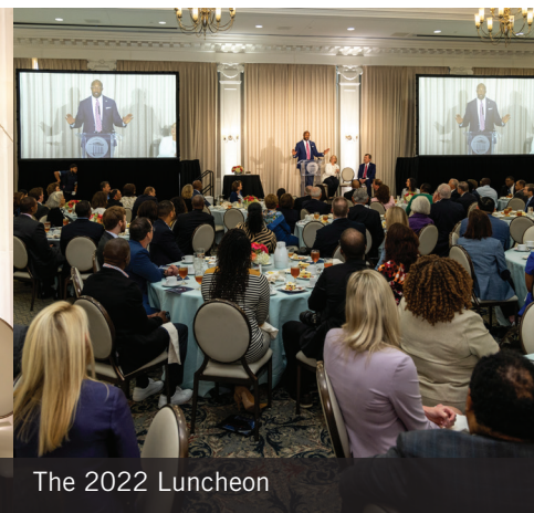
The 2022 Luncheon