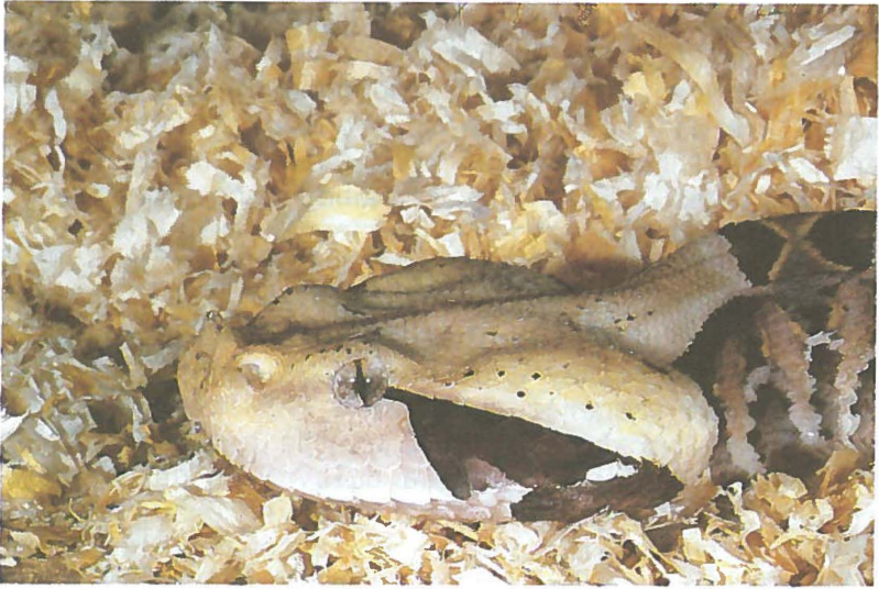
Fig. 1. Bitis gabonica rhinoceros .