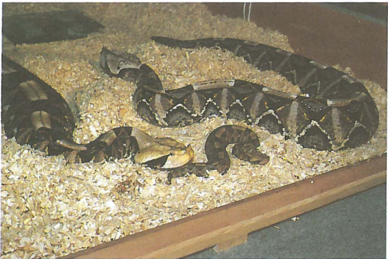
Fig. 2. Bitis gabonica rhinoceros .