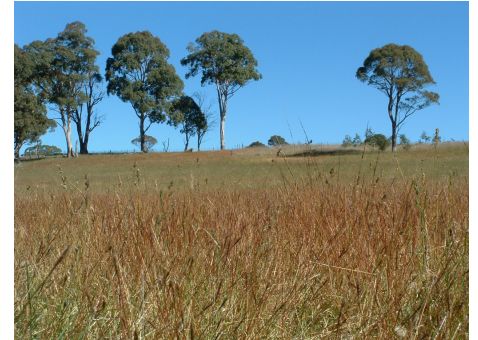
Above—A redgrass-Parramatta grass naturalised pasture, with cocksfoot.

Twelve paddocks of this pasture type ran 6.6 DSE/ha (78% sheep) in 2004.