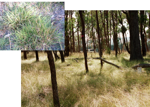
Above and inset— Microlaena pastures.