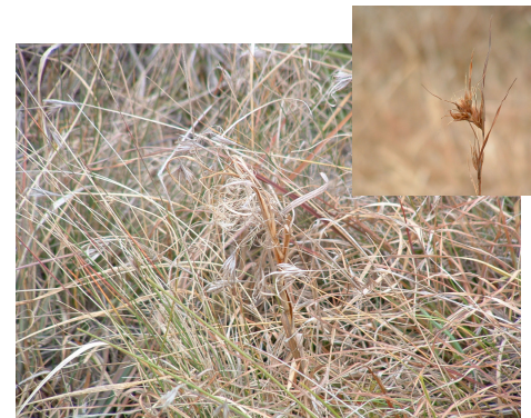
Above—A kangaroo grass-wild sorghum pasture. Inset—Kangaroo grass seed head.