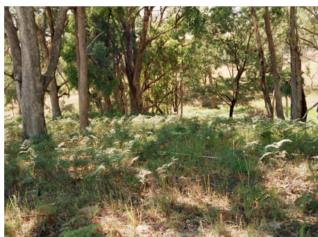
Above—Timber with a bracken fern understorey.