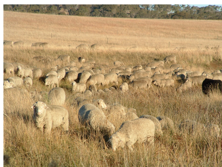
Above—Sheep grazing on native pasture.

Sown pastures that have reverted to native dominance (naturalised pastures) are characterised by winter-active sown grasses and legumes and summer-active, grazing-tolerant native grasses. Such pastures provide forage in both summer and winter.