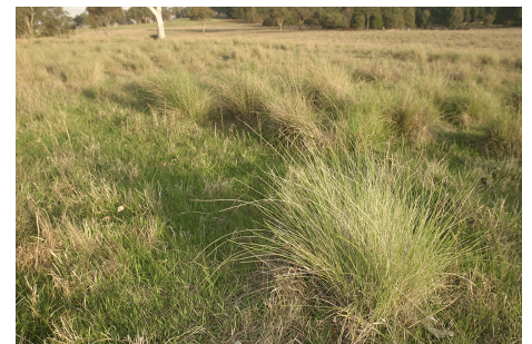
Above—A tussock poa pasture.