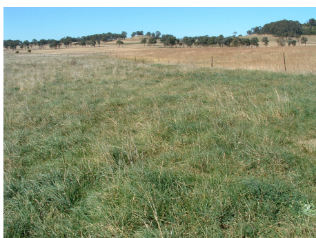
Above—A sown pasture.