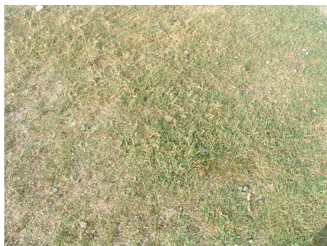
Above—A couch pasture.