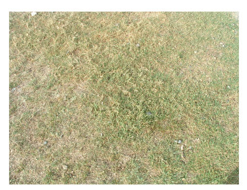
Above-A couch pasture.