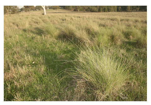
Above-A tussock poa pasture.