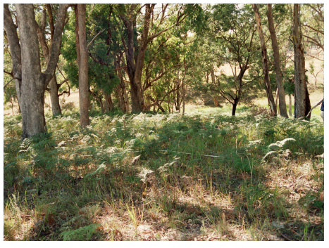
Above-Timber with a bracken fern understorey.