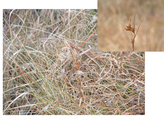
Above—A kangaroo grass-wild sorghum pasture. Inset—Kangaroo grass seed head.