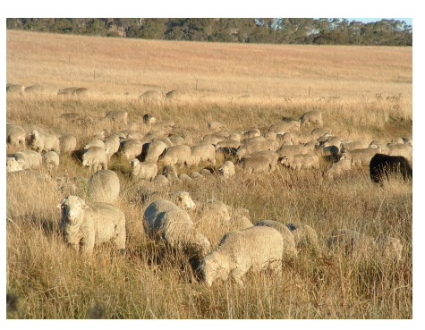
Above-Sheep grazing on native pasture.

Sown pastures that have reverted to native dominance (naturalised pastures) are characterised by winter-active sown grasses and legumes and summeractive, grazing-tolerant native grasses. Such pastures provide forage in both summer and winter.